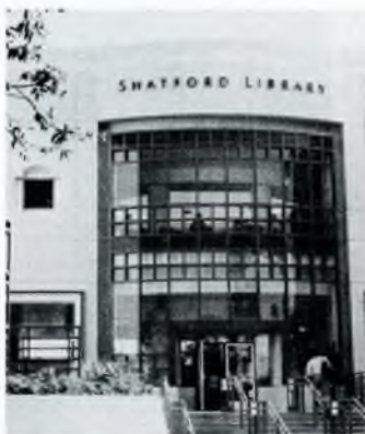
The new Walter T. Shatford II Library at Pasadena City College.