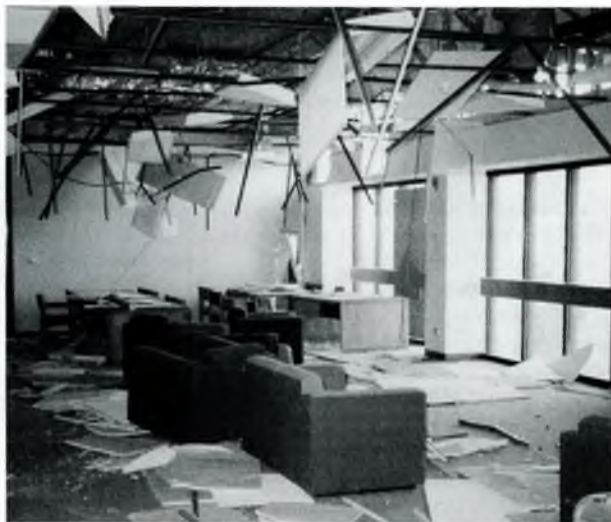
Part of the University of California, Northridge, Library after the earthquake on January 17.

The Clinton administration's Information Infrastructure Task Force (IITF) announced on December 16, 1993, the operation of a computer bulletin board system. The purpose is to pro-