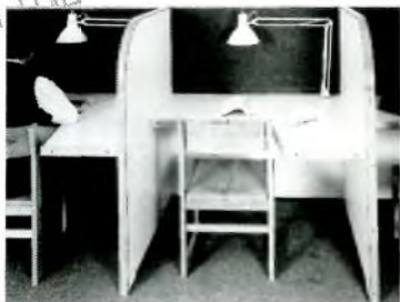
Single-level Study Carrels