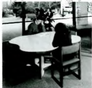
The Amoeba Table