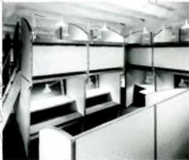
Double-level Study Carrels