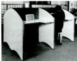
Carrels for automation