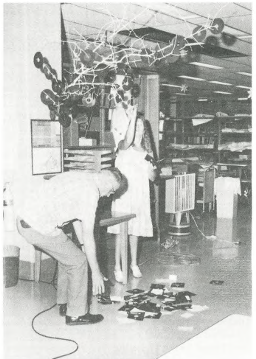
Figure 3. The software tree.

Disks are permanently encased in plastic sleeves, with a cloth-type lining that is impregnated with a silicone lubricant. This lining holds moisture. For those disks only slightly wet (no water spurted out when the disk was squeezed) a hair dryer with an "air" setting (no heat) was used to thoroughly dry the sleeve lining (see Figure 1). The disk sleeve was held slightly away from the disk and air was directed into the sleeve, being careful to dry both sides of the disk, both sides of the sleeve lining, and