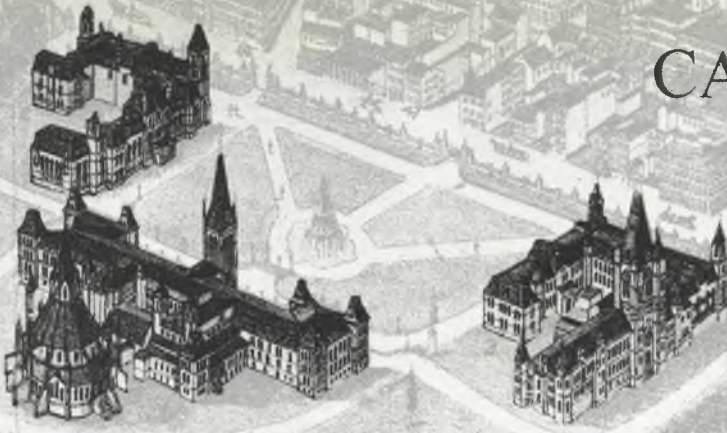
Buildings of Parliament -- Ottawa, 1876

The narrative of Canadian self government is a vital part of the legislative history of Western democracies.