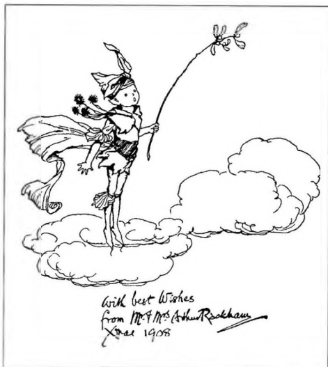
A sketch from a 1980 Rackham Christmas card, part of the Chalot Family Arthur Rackham Collection.

in classic children's literature of the late 19th century. Some titles in the collection include Cinderella , Mother Goose , and Alice's Adventures in Wonderland .