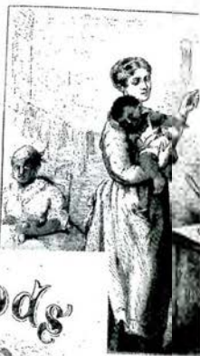
1870s, and 40-year-old baby Page 20

my prompt reply on the a little black eye I waited for New had ever known look felt sick in the act of of these about me, my nose-ears by window, and I began in answer to the