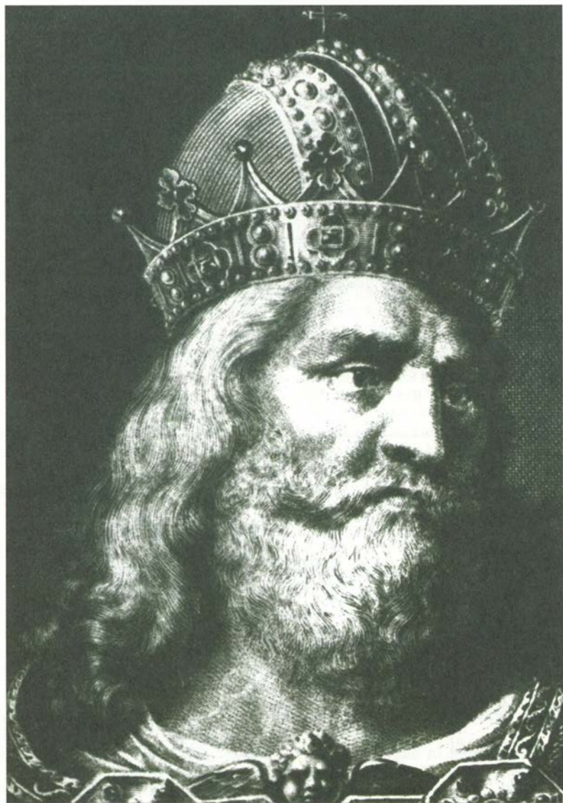
Charlemagne (742-814), benefactor, Bibliothèque Nationale, Paris