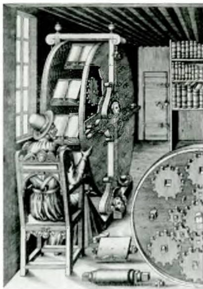
Illustration showing a 16th-century book wheel used by scholars to peruse many books at one time.

Campus Wide Information Systems (CWIS) were the topic of the 1992 INFORMA meeting held in May on Hilton Head Island, South Carolina. CWIS integrate and organize information resources in a form easily accessible to individual