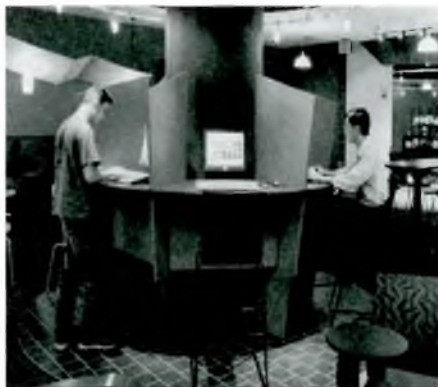
Students using the e-bar at Northeastern University's Cyber Cafe. The e-bar is the physical hub of the space, hosting six flat-screen computers surrounded by comfortable lounge seating and study spaces.

meet the needs of both the information user and the producer.