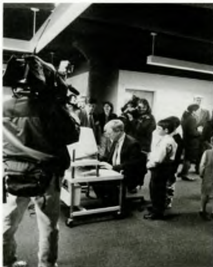
Maine Governor Angus King sat at a library computer and changed the name of the University of Southern Maine's library to the "Albert Brenner Glickman Family Library."