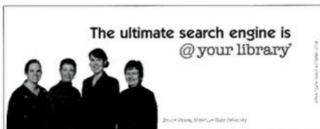
Ultimate Search Engine poster, © ALA Graphics, all rights reserved

Information about customizing your own "The Ultimate Search Engine is @ your library" or "Read" posters and bookmarks is available online at www.alastore.ala.org (click on "Customization"), or call John Chrastka at ALA graphics: (800) 545-2433, ext. 4027. ■