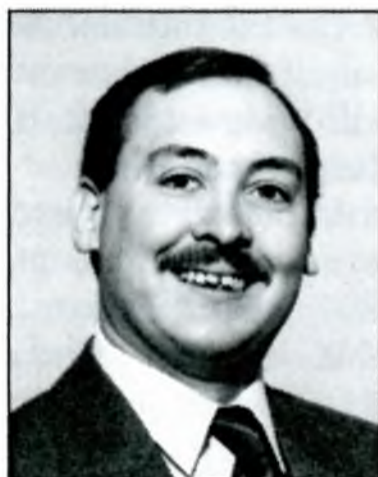
Forrest Link Northeast