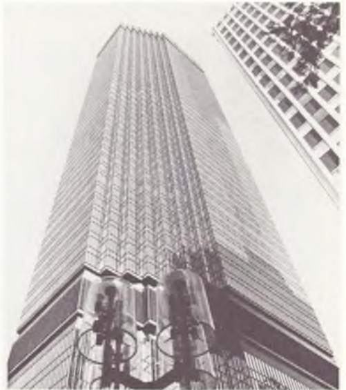
The 57 story IDS building dominates the skyline of downtown Minneapolis.

This paper discusses the results of a recent study which compared the behavior styles, values and work preferences of catalog and reference librarians employed in 16 large university libraries. The data confirmed differences between university catalog and reference librarians, not only in terms of the nature of the work performed, but also in attitudes, interests, and work preferences. Furthermore, the study revealed that university librarianship as a profession exhibits very distinctive and potentially dysfunctional values and atti-