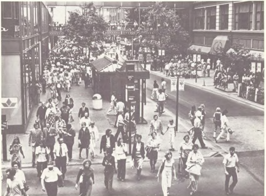
Nicollet Mall in downtown Minneapolis

Approval plans have had a major impact on libraries and the scholarly publishers. In many academic libraries the approval plan profile was the first comprehensive effort to define the level and scope of book buying in subject areas. Can approval plans survive the "decade of retrenchment" in libraries? Many scholarly publishers rely on approval plan sales, but are faced with shorter production runs and increased costs. This paper predicts an increase in the number of institutions participating in approval plans.