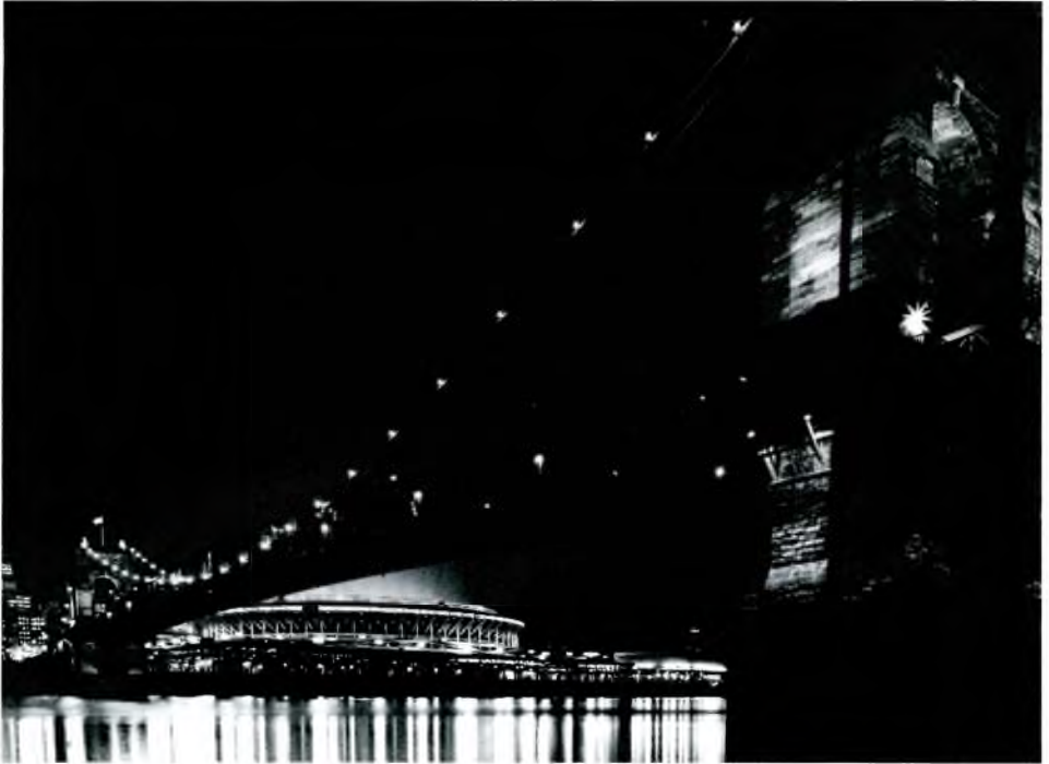
The graceful span of the John A. Roebling Suspension Bridge is a contrast of Old World charm against the skyline of downtown Cincinnati.

route. Queen City Metro also provides service to about 45 other routes at various prices.