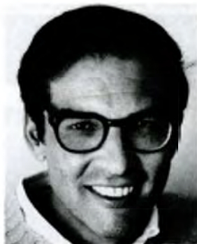
Robert A. Caro