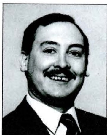
Forrest Link Northeast