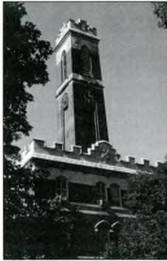
Kirkland Hall on the campus of Vanderbilt University

Vanderbilt has a full-time faculty of more than 1,600, plus more than 1,100 part-time and adjunct faculty who serve teaching and clinical roles primarily in the Schools of Medicine and Nursing. The institution has recruited many eminent scholars who excel in teaching and