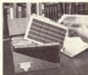
Over 1,100 LC Entries are contained on a single Microfiche card . . . millions compressed into a desk-top 20-inch Microfiche file.

The new way is the Micrographic Catalog Retrieval System that automates your search and print-out procedures. Basically we have done the filing and look-ups for you, giving you a quick-find index by both LC Card Number and Main Entry. You have only to select the proper Microfiche card from the quick-find index. Insert this card in a Reader-Printer. Just six seconds later you have a full-size LC copy.