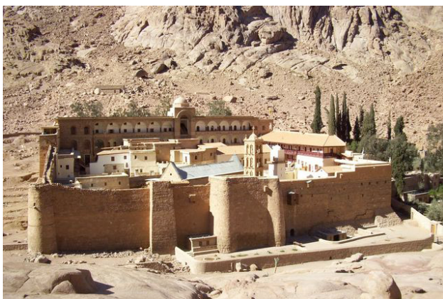
The fathers of St. Catherine's Monastery have been careful stewards of the oldest continually operating library in the world for centuries.

Built in the sixth century, St. Catherine's Monastery holds the oldest continually operating library in the world. Its manuscripts cover subjects ranging from history and philosophy to medicine and spirituality. However, access to this remote region has always been difficult, and the Sinai's unsettled political climate has made this project even more essential. This extensive collection of manuscripts becoming accessible to scholars around the world is thanks to the support of a $980,000 grant from the Arcadia Fund.