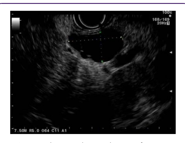
FIG. 2. Endoscopic ultrasound image of a 2.3 \times 1.3 cm anechoic lesion adjacent to the pancreatic tail.

The patient's symptoms resolved shortly following his emergency room visit, with normalization of his stools and resolution of his abdominal pain. After careful review of his images, his pancreatic lesion was felt to represent a cystic pancreatic mass and less likely a pseudocyst or a solid pseudopapillary tumor with cystic components. He was referred for an endoscopic ultrasound (EUS) to further characterize his lesion. An EUS (Fig. 2) performed in December 2014 noted a 2.2 \times 2.2 cm thick-walled pancreatic tail lesion with a hypoechoic center and several adjacent anechoic lesions, the largest of which was 2.3 \times 1.3 cm. The pancreas otherwise appeared normal. Fine needle aspira-