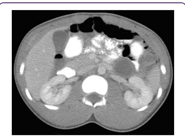
FIG. 1. Computer tomographic scan of abdomen. Multiseptated cystic structure in the pancreatic tail (3.5 \times 4 \times 5 \text{ cm}) .

remaining hepatic function panel, complete blood count, lipase, and amylase were normal. An abdominal ultrasound suggested a cystic structure medial to the left kidney with thickened internal septations. Despite repeating the abdominal ultrasound in multiple planes, it remained unclear whether the structure represented a distended fluid-filled loop of colon or a unique cystic lesion. Subsequent computerized axial tomography (Fig. 1) revealed a multiseptated cystic structure in the pancreatic tail measuring 3.5 \times 4 \times 5 cm with peripheral hyperdensities compatible with extrapancreatic calcifications. Several of the cystic components demonstrated thickened walls with mild enhancement. The pancreatic parenchyma and pancreatic duct appeared normal. No other pancreatic lesions were identified. Multiple mildly dilated fluid-filled loops of large and small bowel with air-fluid levels compatible with gastroenteritis were also noted, which were felt to be the likely etiology of his symptoms.