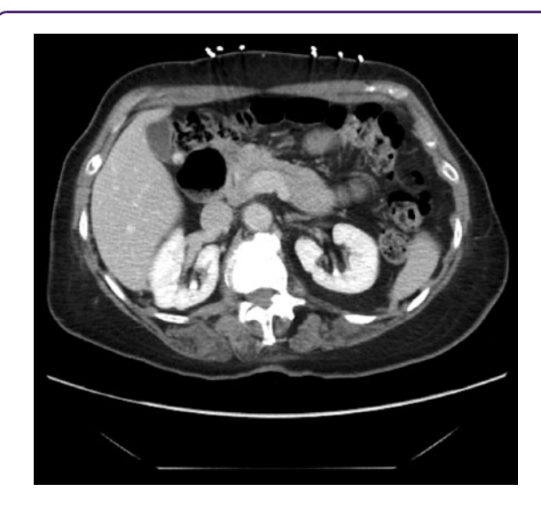
FIG. 1. Computed tomography scan at the initial presentation.

glucose of 55 mg/dL, a c-peptide level of 2.87 ng/mL, and an insulin level of 6.6 mcU/L. Her carcinoembryonic antigen, CA19-9, and bilirubin levels were normal. She underwent an endoscopic ultrasonography that showed an 8 mm mass thought to be in the head of the pancreas. Her CT scan was reviewed at her initial outpatient consultation visit, and she was noted to have a hypervascular mass in the central pancreas with no evidence of dissemination (Fig. 1). The clinical impression was that she had an insulinoma located in the cen-