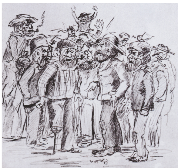
Figure 4. Pablo Picasso, Congreso de anarquistas , ca. 1893. Reproduced with permission from the Real Academia Gallega, El primer Picasso. A Coruña 2015 ; A Coruña: Museo de Bellas Artes, 2015, p. 205.

What is more surprising is the late appearance of his more political or ideological caricatures, dated around 1892 and 1893, like Congreso de anarquistas 37 (Figure 4), only reproduced many years later in art journals, taking advantage of Picasso's prestige. The group portrait of the anarchists rebelling has all the ingredients of the satirical drawing, here reinforced by the expressionist lines and a psychological study of the faces of the characters in the foreground, which reveal the precocious maturity of the young artist, able to portray the inner strength of those trade unionists in political and aesthetic terms.