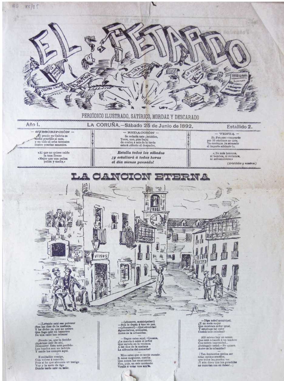
Figure 3. El Petardo , 25 July 1892. Printed magazine. 40.5 × 30 cm, Real Academia Gallega, A Coruña.

More than the consolidation of a specific style, the previously mentioned characteristics tells us, through an analysis of his “little newspapers”, that the adolescent Ruiz Picasso engaged with the way of thinking of the city and into many of its customs and commonplaces, how he interprets it with humour, but above all how he reproduces a distinctive sociology of fin-de-siècle Galicia, between the weight of the rural and provincial and an urban desire to emerge, looking at the world from the fragmented metonymy of that Coruña which defended the Athenian slogan that no one was a foreigner in the city. Here we can find the seed and the graphic expression of the critical and social rather than political consciousness of the teenager, in line with what Jean-Pierre Jouffroy argues (“Debemos señalar, en primer lugar, que los dibujos de juventud publicados tanto en la prensa española como francesa se refieren más a la crítica social y no a las relaciones directas con la política” [we should point out, first of all, that the juvenile drawings published in the Spanish and French press refer more to social