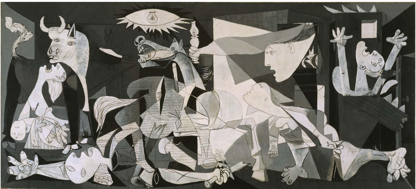
Guernica (1937), Pablo Picasso, © 2019 - Succession Pablo Picasso - SACK (Korea)