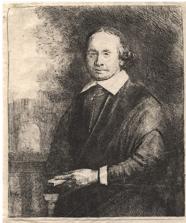
Figure 2. An impression (etching) by Rembrandt of the physician Jan Antonides van der Linden.