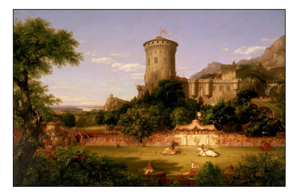
Image 10 Thomas Cole, Present (1838) Reproduced with permission of Meade Art Museum, Amherst College, Amherst, MA

Image 9 Thomas Cole, Past (1838) Reproduced with permission of Meade Art Museum, Amherst College, Amherst, MA