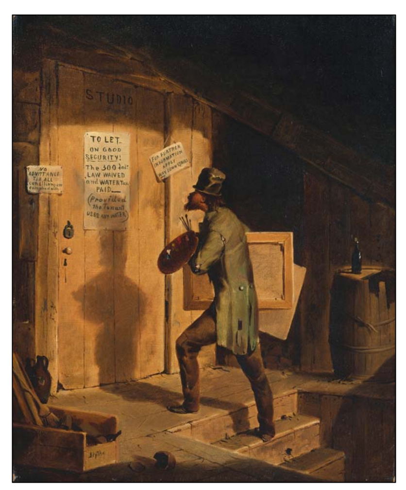
V. THOMAS COLE AND THE AMBIVALENCE OF PROGRESS

Image 8 David Gilmour Blythe, Art Versus Law (1859-60) Reproduced with permission of the Brooklyn Museum, Brooklyn, NY.