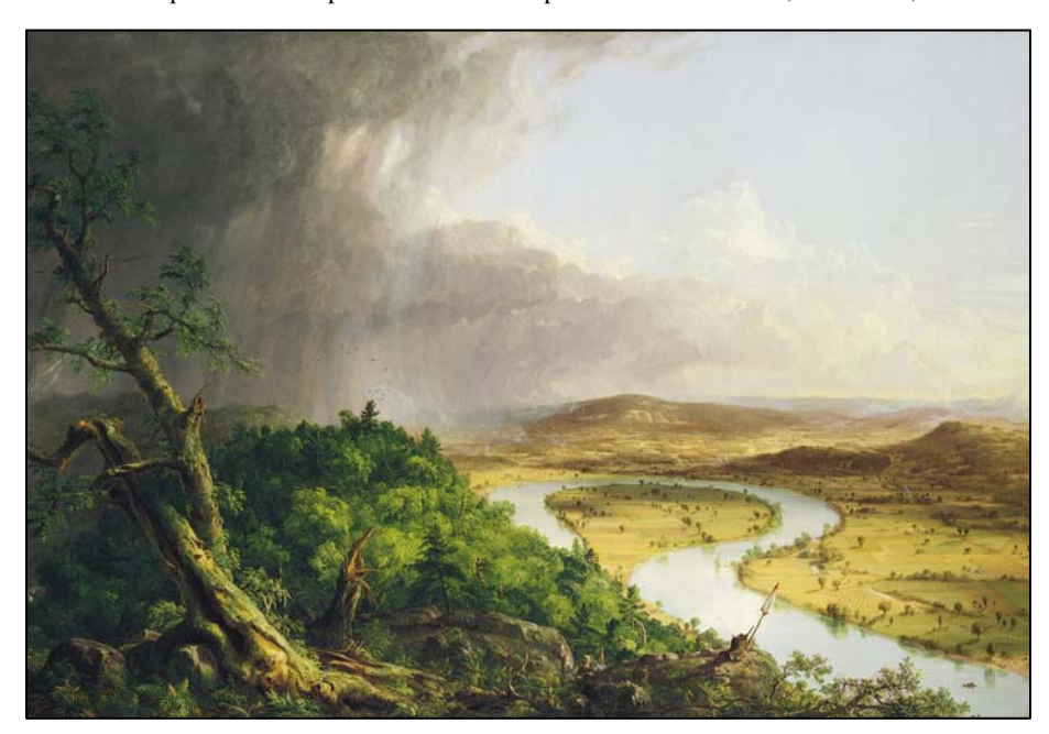
Image 4 Thomas Cole, Oxbow (1836)

There is a common language and mode of thinking among the landscape painters and other culture bearers of the mid-nineteenth century, such as lawyers, judges, and academics: they wrote of a constellation of ideas, of nature, of humans, of democracy, property, and progress.<sup>43</sup> And we can see the human divisions of property in their paintings.