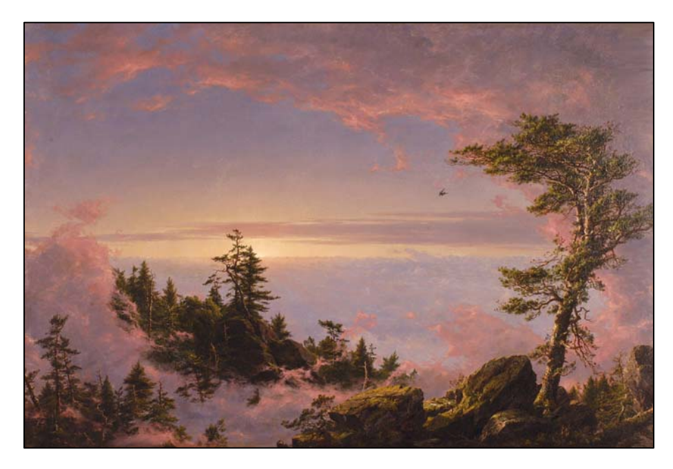
I. THE AMERICAN SCHOLAR AND THE AMERICAN JURIST

Frederic Church, Above the Clouds at Sunrise (1849) Reproduced with permission of Gulf States Paper Corporation. Property of the Westervelt Company and displayed in the Westervelt-Warner Museum of American Art in Tuscaloosa, AL.