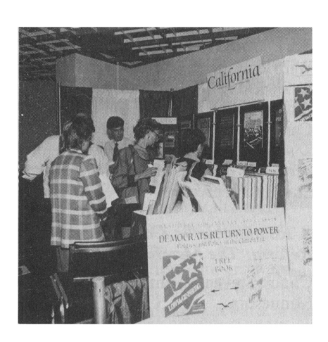
The APSA Book Exhibit—the largest such exhibit in the world.

The most heavily attended panel was a roundtable on Ideas and Foreign Policy: The State of Study chaired by Judith Goldstein of Stanford University. The participants in this panel, and all other panels with