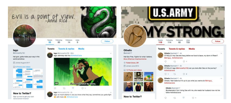
Students modified their Twitter profiles, from images to the text of their profile description, to emulate characters. Left: Iago; Right: Othello.

Dramaturgy and devising activities in class facilitated students determining the major "beats" or plot elements that could not be left out in order for the basic story to hold together. Students used their own handles to perform different roles in each act over a five class-day period, or two weeks; most of the actual activity of performance took place over the course of the day outside of class time. The play famously opens with two men shouting racial epithets to Desdemona's father in the wee hours of the night; the students started their play at roughly one in the morning to mimic that temporality which a traditional play could never do. They also had to make choices about props and how to translate early modern materials into modern ones. Particularly memorable was the strawberry stitched handkerchief that travels between characters, charting Desdemona's chastity or presumed lack thereof. Instead, emulating the cultural specificity of the Pacific Northwest, students reimagined it as a hydro-flask decked with strawberry stickers.