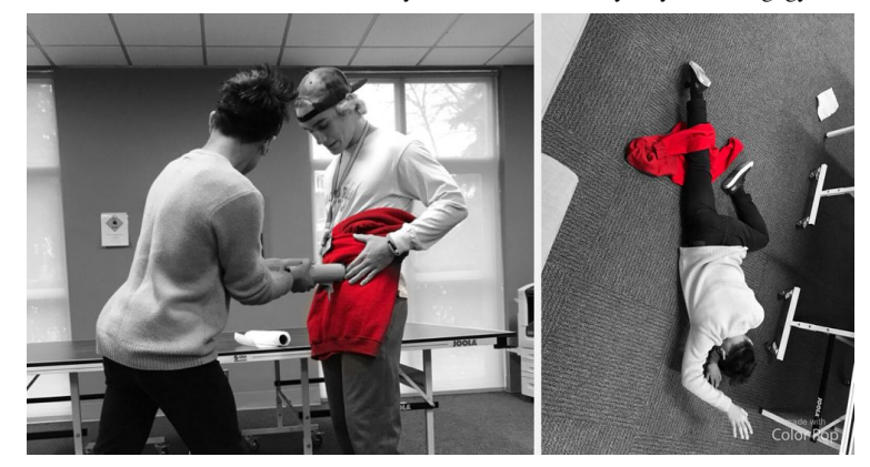
Students used a color-filtering app to represent the multiple deaths at the end of the play symbolically.

The #OthelloSyllabus: Twitter as Play | Hybrid Pedagogy