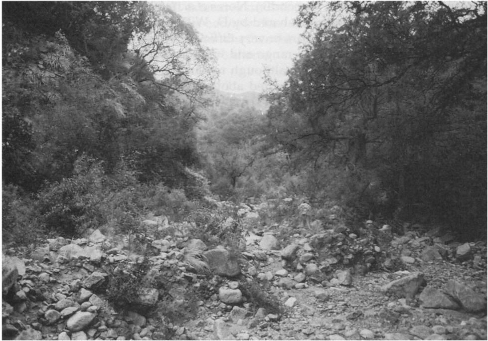
Figure 3. Transitional woodlands at Cerro Uritorco, Sierra Grande, Córdoba, Argentina, March 1991.

species has rarely been recorded in Formosa (two records); at Río Pilcomayo National Park birds were observed in an isolated woodland dominated by Prosopis sp. surrounded by marshland (park guard verbally to M.P.). Given that five of the seven other humid chaco records refer to hybrids (see Figure 1 and Appendix), it seems conceivable that the humid chaco is unusual habitat for the species, and further investigation on this hybridization zone needs to be conducted in order to shed more light about the status of the species there.