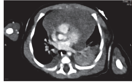
FIGURE 2: CT of chest/abdomen/pelvis demonstrated a homogeneously enhancing anterior mediastinal mass which maintained thymic contour, with mass effect upon the vessels and airway.

Despite resolution of the coagulopathy, the anterior mediastinal mass remained. The differential diagnosis included venous or lymphatic malformations, thymic enlargement, or rarer tumors. Therefore, further diagnostic imaging of the anterior mediastinal mass was pursued. A chest ultrasound revealed a solid mass without cystic components, making an infantile lymphangioma unlikely. A CT of chest/abdomen/pelvis (Figure 2) demonstrated a homogeneously enhancing anterior mediastinal mass which maintained thymic contour, with mass effect upon the vessels and airway. The homogeneity of the mass was thought to be inconsistent with the typical appearance of a germ cell tumor. While the infant's coagulopathy and borderline thrombocytopenia initially raised concern for Kasabach-Merritt phenomenon