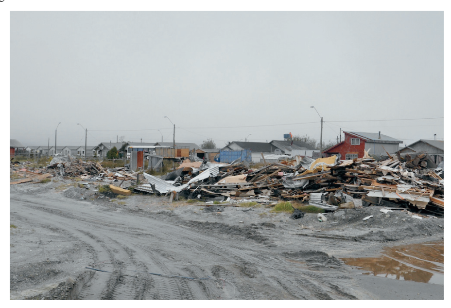
Fig. 3 Part of demolished housing units in southern Chaiten

Although there are many Chaiteninos still in "exile", not all of them will return to Chaiten as some have effectively integrated into other locations.