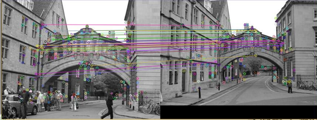
Figure 3. Feature Matching Experiments