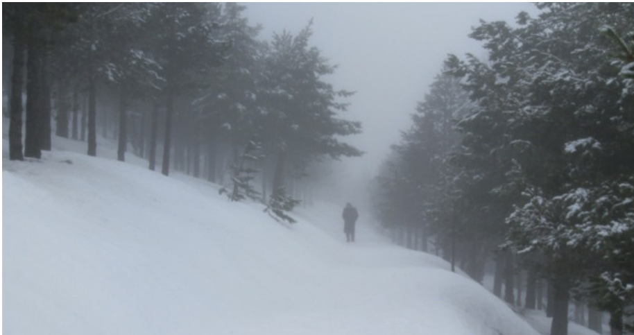
FIGURE 1 | Ori Gersht, Evaders , 2010, Still from DVD projection

Ori Gersht has always been interested in World War II and postwar conflicts so it is not surprising that his new series of works is focused on three war situations. The three works in this exhibition refer to fear and violence but they do so through seductive and poetic imagery. As a metaphor of this suffering, the subjects have in common, human suffering and landscape.