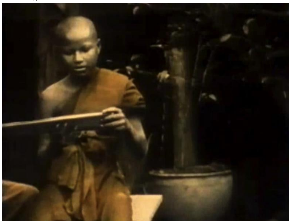
Figure 2. FROM THE POLE TO THE EQUATOR, Angela Ricci-Lucchi/Yervant Gianikian, I/D 1987

In my book Experimental Ethnography , I wrote about found footage filmmaking in terms of apocalypse culture. 4 In 1999 it seemed as if this mode of film practice was preoccupied with 'the end of history' and the promise that Benjamin held out for cinema had failed to be realized. Seventeen years later, as archival film practices have become more prevalent in mainstream culture, and in experimental media, I am more optimistic about the cultural role of audio-visual appropriation. One key change has been a shift in theory and practice to the recognition of the research function implicit in archival film practices. 'Found footage' links the mode to surrealist practices of accident and recontextualization, but negates the extensive searching that sustains the practice. Recognition of the search function in archiveology highlights the role of the moving-image archive, and its transformation in digital culture. The filmmaker is not unlike the archaeologist who 'finds' things and is able to recognize their cultural value. Whether their search is conducted by algorithm, or through files or film cans, every find for the filmmaker is a lucky find when it can be recombined with other images to create a new experience and even new knowledge.