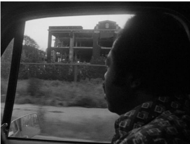
Figure 18. LOS ANGELES PLAYS ITSELF , Thom Andersen, USA 2003

Andersen’s narration in LOS ANGELES PLAYS ITSELF borrows some of the postmodern critique of image culture, but complicates it with a recognition of the untimeliness of historical disjunction and displacement. By organizing his cinematic collection around the use and reuse of specific L.A. locations, Andersen evokes a key principle of archival film practices. He says: “If we can appreciate documentaries for their dramatic qualities, perhaps we can appreciate fiction films for their documentary revelations.” 39 Extracting a sense of place from the multitude of films set in Los Angeles, Andersen reveals cultural significance precisely by transforming Hollywood films into archival fragments.