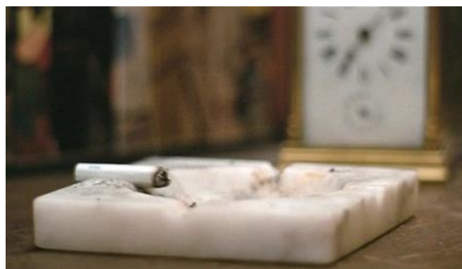
Figure 7. THE CLOCK , Christian Marclay, UK 2010

Jussi Parikka notes that “an archivology [sic] of media does not simply analyze the cultural archive but actively opens new kinds of archival action.” 18 For Parikka, following Wolfgang Ernst, this action seems to be specifically tied to data banks, algorithms and other technical processes. The archive is no longer passive, but is made to generate “new insights” and “unexpected statements and perspectives.” 19 Benjamin’s conception of the image, in conjunction with his insights into media, historiography, and the avant-garde provide a means of thinking of archiveology as a creative practice produced by humans, not machines. Archiveology in this sense involves the interface of human and machine, or as Miriam Hansen has argued in her parsing of Benjamin, a gamble with technology, with the stakes that of the survival of the human senses within the domain of technology. 20 Many filmmakers refer to their work as archaeological, and their films are evidence that media archaeology needs to account for images and sounds, viewers and makers.