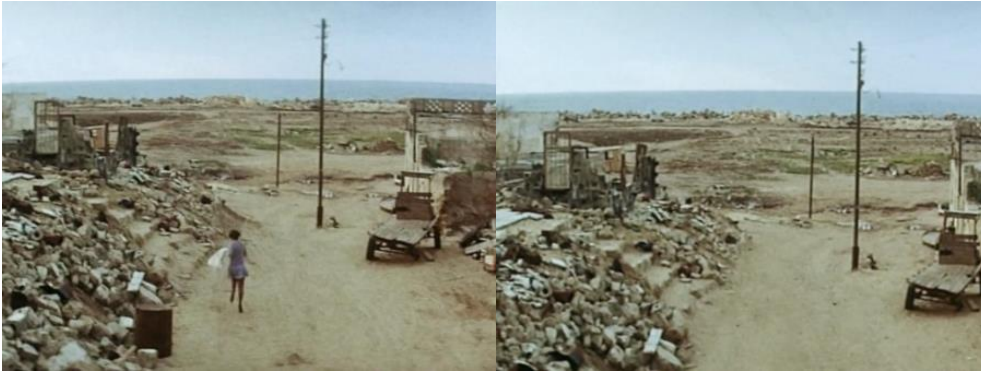
Figure 10. RECOLLECTION , Kamal Aljafari, D 2015

Digital cinema is an unreliable cinema, but once we give ourselves up to the performativity of visual language, the falsification of the image can be used in creative ways. For example, Kamal Aljafari's RECOLLECTION (D 2015) is made from Israeli feature films shot in Jaffa. Using digital effects, Aljafari has removed the principle actors from the locations, leaving behind only the streets and buildings, many of them ruined by years of conflict. He lingers on the figures on the periphery, zooming into close-ups of Palestinian extras that he finally, at the end of the film, suggests may be relatives and acquaintances. The images are rendered inauthentic due to his magic tricks, but then given a new reality through his retrospective assignation of names and characters. RECOLLECTION is a film haunted by ghosts, memories, and a history of violence and Occupation. The ruined city echoes with an emptiness that the viewer is compelled to fill with imagination, and a recognition that the city is much older than the past century of conflict. Aljafari projects himself onto the archival materials in a destructive, poetic, and very personal way. Digital tools have only amplified the means by which images can be 'played' with and yet a film like RECOLLECTION points toward the potential even of destroyed and ruined archives to be remade as new ways of knowing the world.