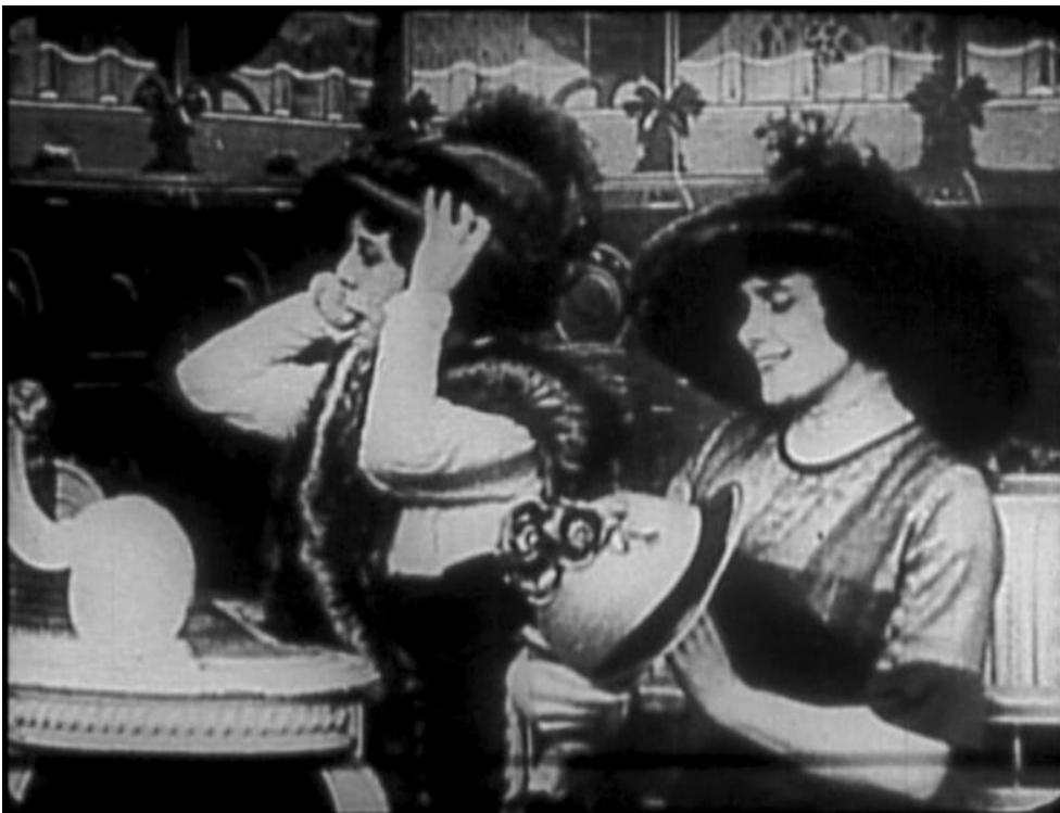
Figure 14. PARIS 1900 , Nicole Védère, F 1947

The city, like the archive, is a living, breathing entity as ‘documents’ are continually added, and more importantly, continually ‘re-discovered’. The surface of the archive is now; its depths are passages to the past. Thus, it is always instructive to return to archive-based films, to be able to discover again what was rediscovered in the past. One of the first compilation films made in the postwar period is PARIS 1900 (F 1947) by Nicole Védère. This film has been largely overlooked by film historians, perhaps because its director, Nicole Védère, made too few films and was the wrong gender to become recognized as an important French auteur. It may also have been overlooked because in 1947 it challenged the usual paradigms of film classification. Jay Leyda recognized it in his book Films Beget Films , and he situated it within a history of such filmmaking that drew primarily on newsreels. 30 However, Védère takes the compilation format a substantial step forward by combining clips of fiction film footage with photographs, newsreel and actualité footage, and by the scope of her archival research. In addition to film libraries, she repurposed imagery from personal collections, flea markets and other sources including garrets, blockhouses, cellars, garbage bins and even a rabbit hutch. 31 In other words, PARIS 1900 expands the concept of the archive and ‘official’ history to include many other histories that were recorded on film and subsequently abandoned as inconsequential.