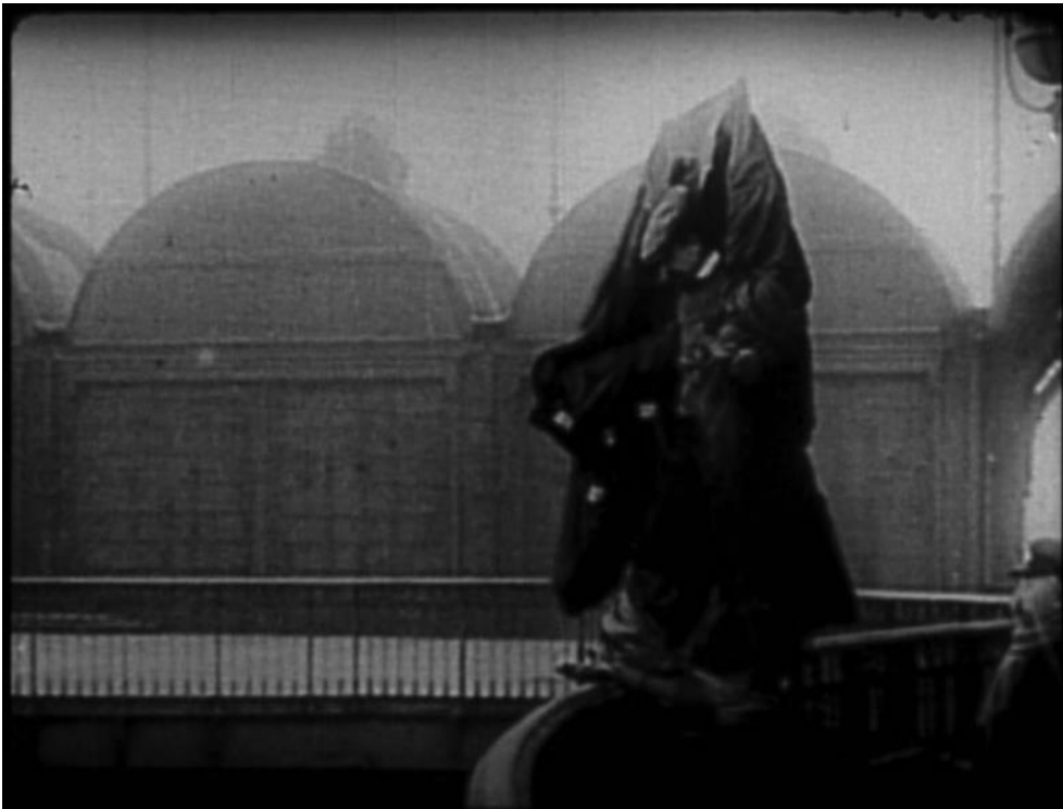
Figure 15. PARIS 1900 , Nicole Védère, F 1947

At the centre of the film is the spectacular death of the Birdman, Franz Reichelt, leaping to his death from the Eiffel Tower in 1912. Captured by Pathé newsreel cameras, this image is emblematic of the vulnerability of the past to teleological narratives of success in which an aviator such as Bleriot is a hero and poor old Reichelt is forgotten. If Védère manages to redeem the Birdman as a hero of an earlier age of the spectacle, her film is arguably consistent with Benjamin’s utopian hope for a flash of something transformative to emerge from the ruins of the past. Benjamin specifically insists that this spark can only be detected within a “constructed” history that articulates not empty time, but time filled by “Jetzeit” or ‘now time’. 34