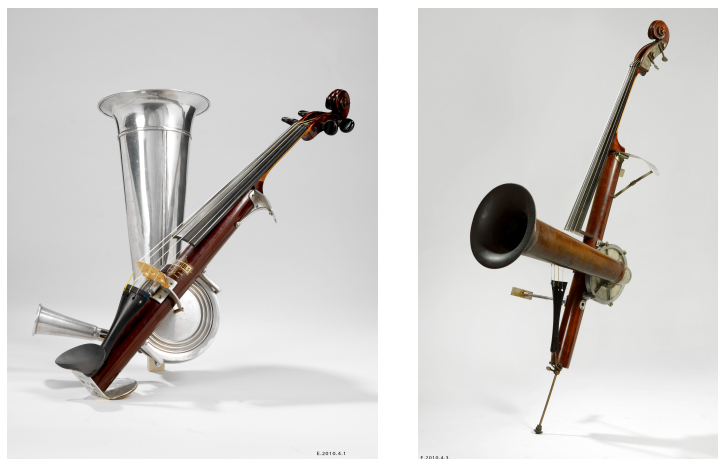
Figure 2: A violin (E.996.10.1, Collection of Musée de la Musique – Paris [13]) and a cello (E.2010.4.3) made by Augustus Stroh, after his patent n° 9418 “Improvements in Violins and other Stringed Instrument”, filed 4 May 1899 and registered 24 March 1900.

The singular Stroh instruments are hard to classify. Instantaneously categorised as “violin-like instrument” in a listening test, these instruments seem however “half- string, half-wind” instrument (Figure 2). A scientific documentation resulting from a pluridisciplinary collaboration (acousticians, curators, musicians) shows that what could be considered as just curious instruments actually appear to be the work of a talented maker, resulting from the process of the engineer Augustus Stroh to meet his original need, i.e. solving part of the difficulties of the sound recording techniques in their infancy [15]. By shedding light on its genesis and history, and explaining their acoustical functioning, this scientific documentation give these instruments a new place in the instrumentarium and make them integral musical instruments. In this sense, this documentation can disrupt the values likely to be conveyed by the instruments and modify their perception by spectators.