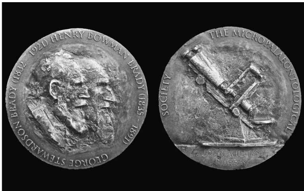
Fig. 3. The Brady Medal.

the surface of the medal and not engraved, thus keeping in harmony with the raised reliefs of the portraits and the microscope.