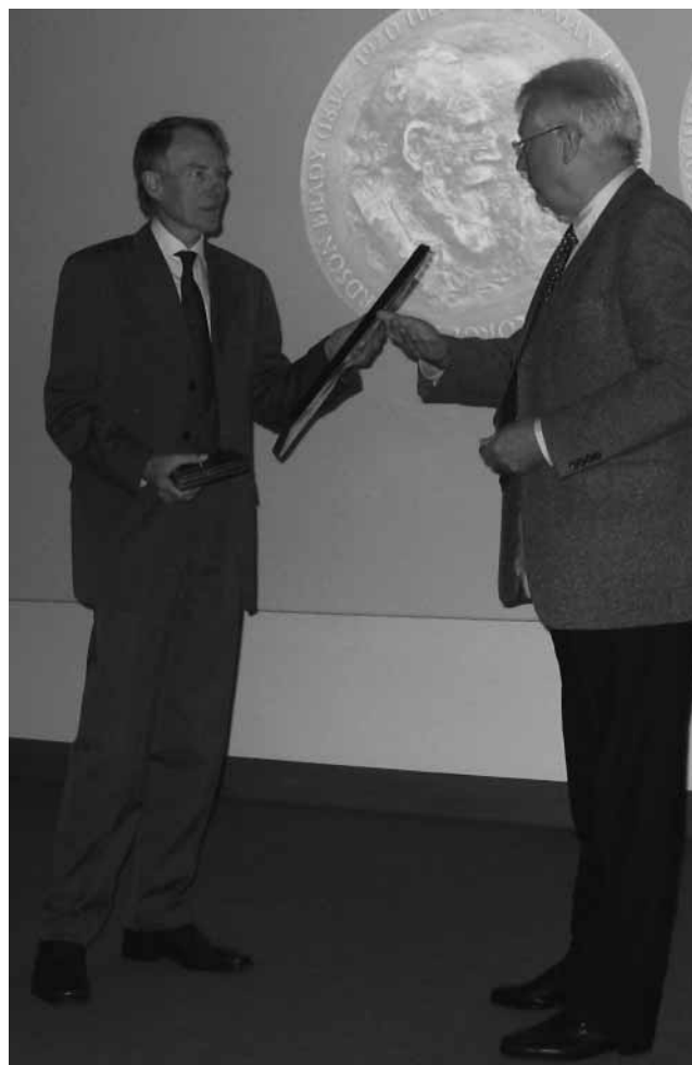
Fig. 4. The First Brady Medallist.