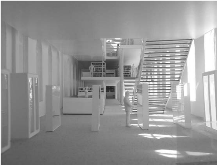
Artist's impression of the new Humanities Library at Utrecht University. Photo: Website Utrecht University, architects Grosfeld van der Velde.

combined main and faculty library (as at Leiden University). In anticipation of a new campus on the Amsterdam business centre ZuidAs, VU University is planning to centralise all arts and humanities libraries in a new location within the main VU building. The TU Delft was forced to move its architecture library into another building because of a devastating fire on 13 May 2008, which ruined the building but left the library collection almost undamaged. 3