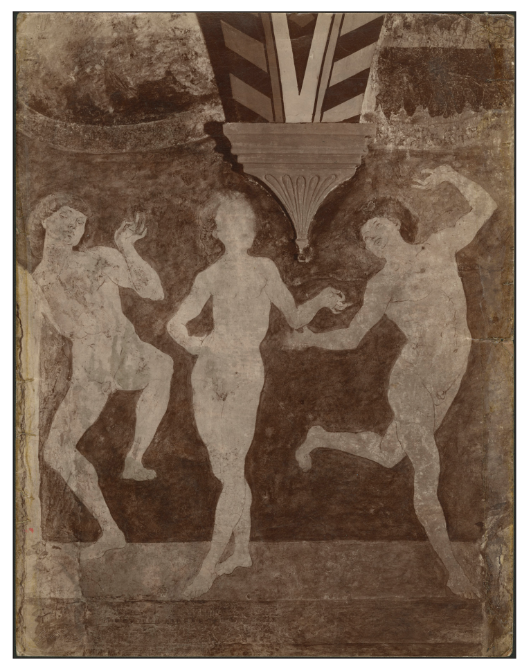
Fig. 4: Antonio Pollaiuolo, Fresco showing the 'Dancing Nudes', c. 1465, Villa La Gallina, Arcetri (Florence), Villa I Tatti, The Harvard University Center for Italian Renaissance Studies, Fototeca Berenson. © President and Fellows of Harvard College.

Indeed, while her monograph aspired to make a substantial historical contribution to scholarship on the Pollaiuoli by including a copious appendix of documents, its aesthetic principles show the strong influence of Bernard.