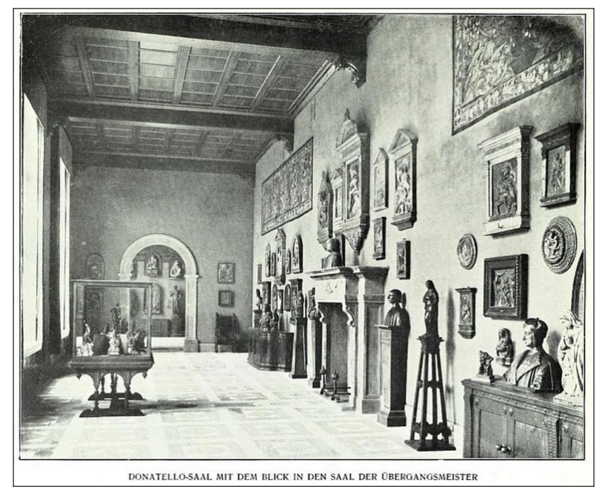
Fig. 2: The Donatello Room at the Kaiser-Friedrich-Museum, 1904.

Bode is interesting. He is very learned and knows so much about the history of Renaissance sculpture and writes delightfully, clearly and concisely, but he seems without any sense of what is good in art. If he finds the same kind of fold or the same motive or some school likeness, it is enough for