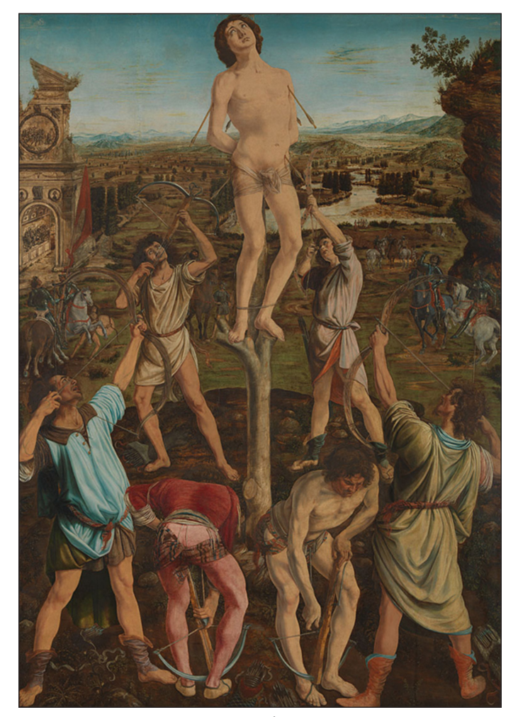
Fig. 5 : Antonio and Piero del Pollaiuolo, The Martyrdom of Saint Sebastian , 1475, oil on wood, 291.5 × 202.6 cm.

While the Morellian method prescribed the study of static physiological forms that bear the trace of an artist's individuality, Cruttwell's writing followed Berenson in the attempt to set forms into motion in order to create a description of the psychology of the artist as well. Particularly interesting is the language that she uses in the passages where she describes the movement of the archers she attributes to Antonio, and the effects these bodies have on the beholder: