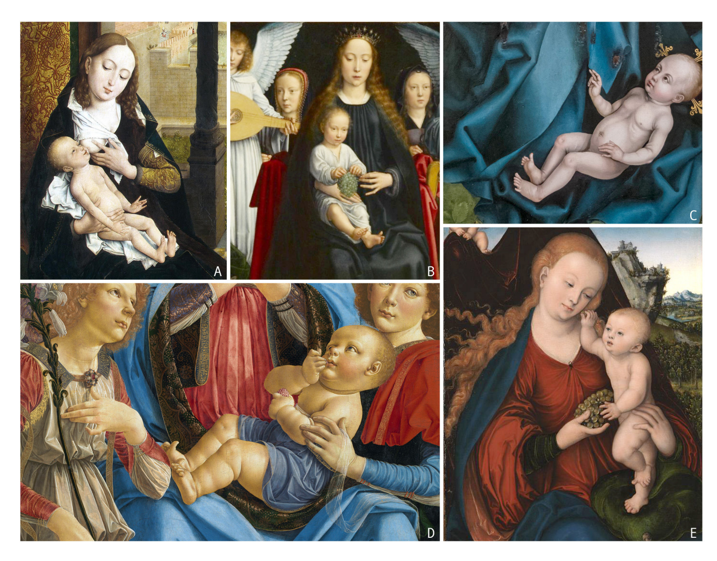
Fig 2 | Details from five paintings depicting a Babinski sign. A: Rogier van der Weyden, St Luke Drawing the Virgin (1435-40), Boston Fine Arts Museum (USA). B: Gérard David, Virgin Among the Virgins (c1509), Musée des Beaux-Arts de Rouen (France). C: Martin Schongauer, Orlier Altarpiece (1470-75), Musée Unterlinden, Colmar (France). D: Verrocchio, The Virgin and Child with Two Angels (1476), National Gallery, London (UK). E: Lucas Cranach the Elder, The Virgin and Child with a Bunch of Grapes (c1525), Alte Pinakothek, Munich (Germany)

The practice of copying works of art was frequent during the Renaissance, particularly for Virgin and Christ Child paintings. The painting Saint Luke Drawing the Virgin, of which many copies exist, is a clear example of this. 18 However, examples of serial paintings, such as Madonna and Child with the Milk Soup by Gérard David, which was reproduced in at least three versions, are rare. The Babinski sign is not present in the version of this painting exhibited in the Palazzo Bianco in Genoa, whereas it is present in the other two versions. Cranach the Elder frequently produced serial paintings of the Madonna and Child, reproducing the Babinski sign each time, but this phenomenon cannot explain the occurrence of the sign in other paintings by the same artist, such as The Virgin and Child with a Bunch of Grapes (Fig 2, E).