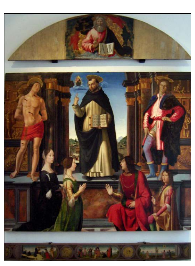
Figure 1. Domenico Ghirlandaio and workshop, Malatesta Altarpiece , tempera on panel (Rimini, Museo della Città)

Advertising Gone Wrong, the authors tweaked an analytic framework, initially used to evaluate advertisements, in order to explore how public art conveys a message and how such conveyance could go wrong. Those authors define three key advertising concepts, of image, headline, and text, and their three parallels in public art, namely visibility, central message, and elaboration. A prime source of risks for both advertising and public art is what the authors call noise, and which we call interference. Elements that interfere distract from, disrupt, or even counter the main message. Attention to disruptive elements allows us to reevaluate the donor portraits in the Malatesta Altarpiece (Rimini, Museo della Città, fig. 1), painted by Domenico Ghirlandaio and his subordinates in 1493–1496.<sup>11</sup>