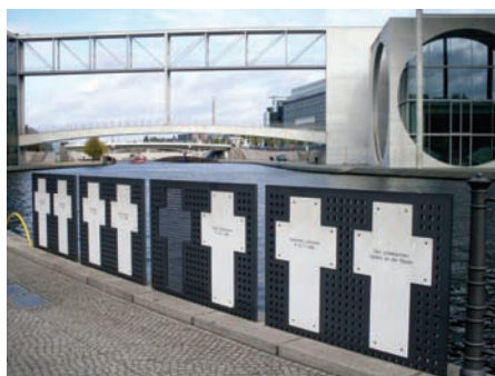
Fig. 4 Detail of memorial could be seen in front of the Bundestag complex. This is one of the numerous examples how the German government pays respect to the victims of the past; Photographs made by the author 2009