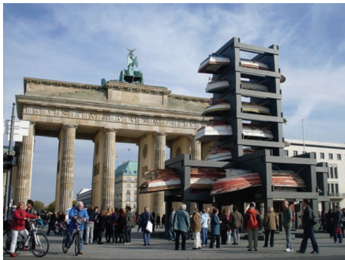
Fig. 10 Installation "At the crossroads" by Greek artist Kalliopi Lemos

Today trend is to make art in open urban space in order to make art more accessible and visible to all citizens. Here is an example how art could assume a role in public space. At Brandenburg gate with installation of Greek artist Kalliopi Lemos. This installation at Brandenburg gate is part of trilogy "Crossing" (Eleusis, Istanbul and Berlin) made by Greek artist Kalliopi Lemos. Each exhibition in this trilogy is consisting of a different installation of wooden Turkish boats which were found abandoned at Greek islands. These three cities are typical route of migration from East to West. Artist raises a question of the feeling of being in between borders, cultures and identities. The last part of trilogy is held in Berlin in period of 13 th -30 th October 2009. By putting this installation in front of the Brandenburg gate, boundaries and limits of art in open spaces are moved forward. Berlin is the best place to make such avant-garde story with a strong message. The time has come when public space also participate in the evolution of art.