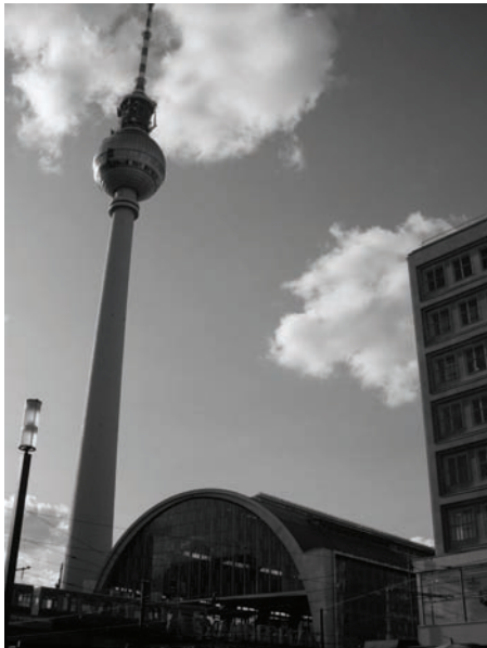
Fig. 8 Fernsehturm

The architectural future of East Berlin is in further urban development. The positive urban development is possible only by integrating typical socialistic architecture. These sky-scrapers from the communistic period are a part of the past. The successful future could not be built by destroying the leftovers of the past. There are always ways of reconstruction that could bring progress and modernization.