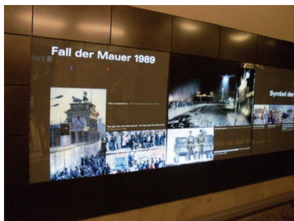
Fig. 1 Wall Memory in metro station at Brandenburg gate; the newest underground station has three lines that going from Hauptbahnhof to Brandenburg gate (Berlin main train station officially opened in 2006 after almost eight years of construction work)