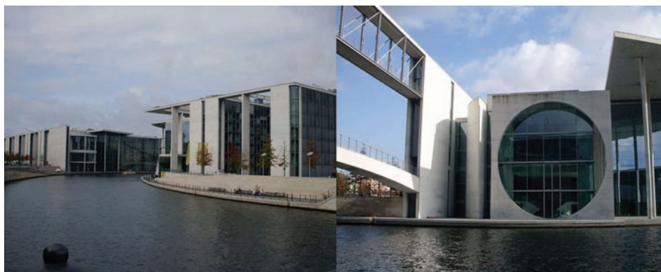
Fig. 3 The two left side buildings are divided by the river Spree. At the left river side is Marie Elisabeth Lüders Haus. At the right side is Paul Löbe Haus