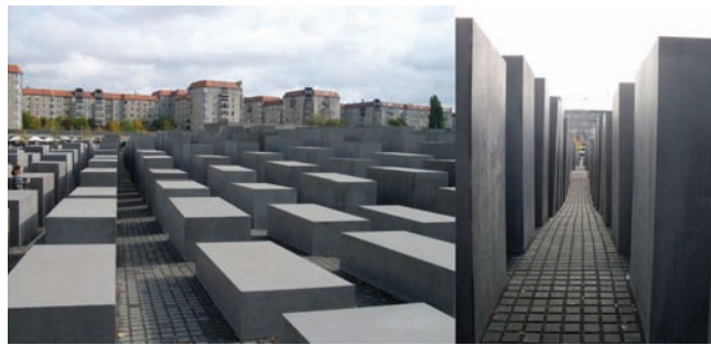
Fig. 5 The Memorial to the murdered Jews of Europe

The Memorial to the murdered Jews of Europe stands in the heart of Berlin, just next to Brandenburg gate in order to send message to all, not only visitors as this is one of the most visited tourist location in the whole Berlin, but also to be visible to the German politicians on their way to Reichstag. This monument, open to public day and night as a place as a remembrance of six million Jewish victims, has been made by the architect Peter Eisenman. The construction work on the Memorial, consisting of the Filed of 2,711 concrete slabs arranged in grid pattern and the underground memorial center, began in 2003 and ended in 2005. The size of the field of concrete slabs is 19.073m 2 with height that vary from 0-4,7m. Each mounted steale has been made from high performance concrete.