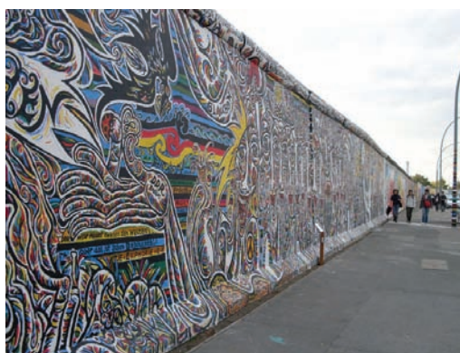
Fig. 7 East Side Gallery

East Berlin became the capital city of the East Germany after Second World War. The typical architecture of socialism is still present in the east part of Berlin. In Figure 7, Figure 8 and Figure 9 the most important parts of East Berlin could be seen. After reunification of Germany, government spent huge investments for reintegration of the two parts of the city. Many changes happened since 1990s. Still, architecture of these two parts, mainly the survival of sky-scrapers from communistic period, made the visual differences between eastern and western part of the town clearly discernible.