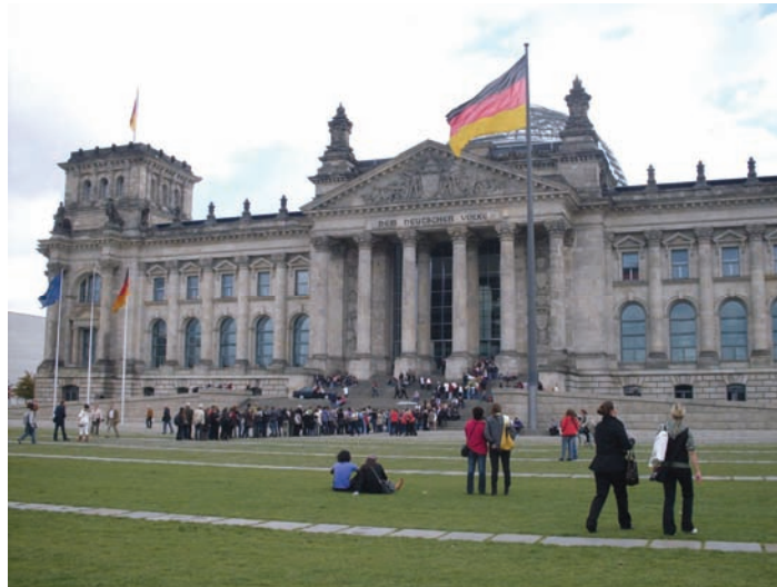
Fig. 2 Reichstag, German Parliament

The original building of the Reichstag, German Parliament, was built in the style of the Italian Renaissance in 1894 by architect Paul Wallot. The Reichstag building suffered huge damage in bombing during World War II. Renovation of the building which was carried out according to plans by Paul Baumgarten, started in 1954 and was finally completed in 1972. After German reunification, Sir Norman Foster was commissioned to carry out the design for new Reichstag. The major change was removing mezzanine floors and adding a new glass dome to the room. Adding the new glass dome was very successful as the dome became one of the main tourist attraction of the city. Glass panels in the dome allows visitors to look at down into the parliamentary chamber beneath.