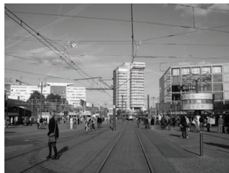
Fig. 9 Alexanderplatz