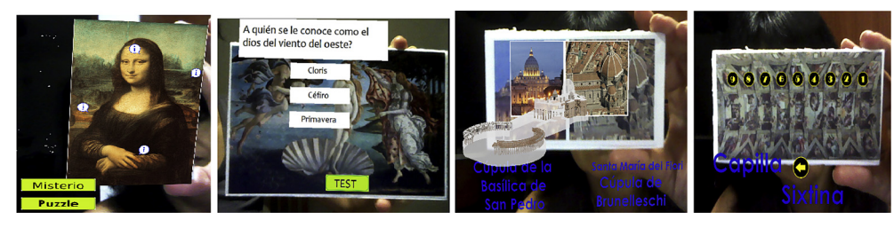
Fig. 1. Italian renaissance art images augmented with information, questions and 3D objects.

The qualitative data was collected looking for quality components of usability: learnability, efficiency, errors and satisfaction identified by Jakob Nielsen (Nielsen, 2003).