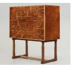
Fig.8. Model no.881 cabinet-on-stand – Josef Frank, 1938

The furniture is characterized by clean and smooth edges - complete shutdown and reduction of glamour design, asymmetry in shortening, form or assembly and a unique combination of materials - wood with glass, leather, stone, chrome. The basic technique of making furniture is the technique of folding the wood. Mainly, the furniture consists of a structure made of twisted wood or chipboard, mostly wooden frames, the use of as few materials as possible and the reduced use of upholstered elements (Raiceva, 1999).