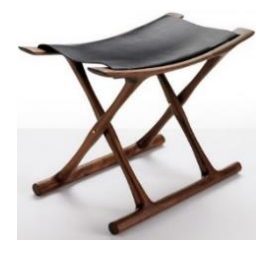
Fig. 9. Egyptian Stool – Ole Wanscher, 1960

As a result of the influence of the previous styles, a type of seats appear - a folded shape of mahogany and leather - e.g. Egyptian Stool (1960), based on an ancient collection of antique pieces in the Berlin Museum (Fiell, 2014). The production consists of high quality construction and finish, showing the skill of the craft tradition in Scandinavia.