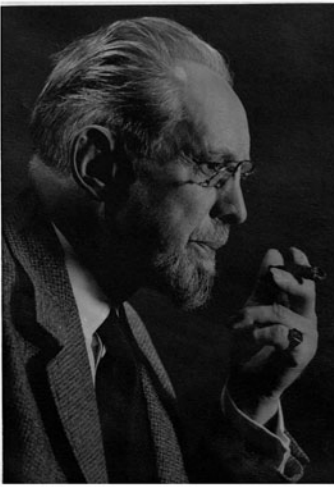
Figure 2. Above left, Max Weber; above right, Werner Sombart.