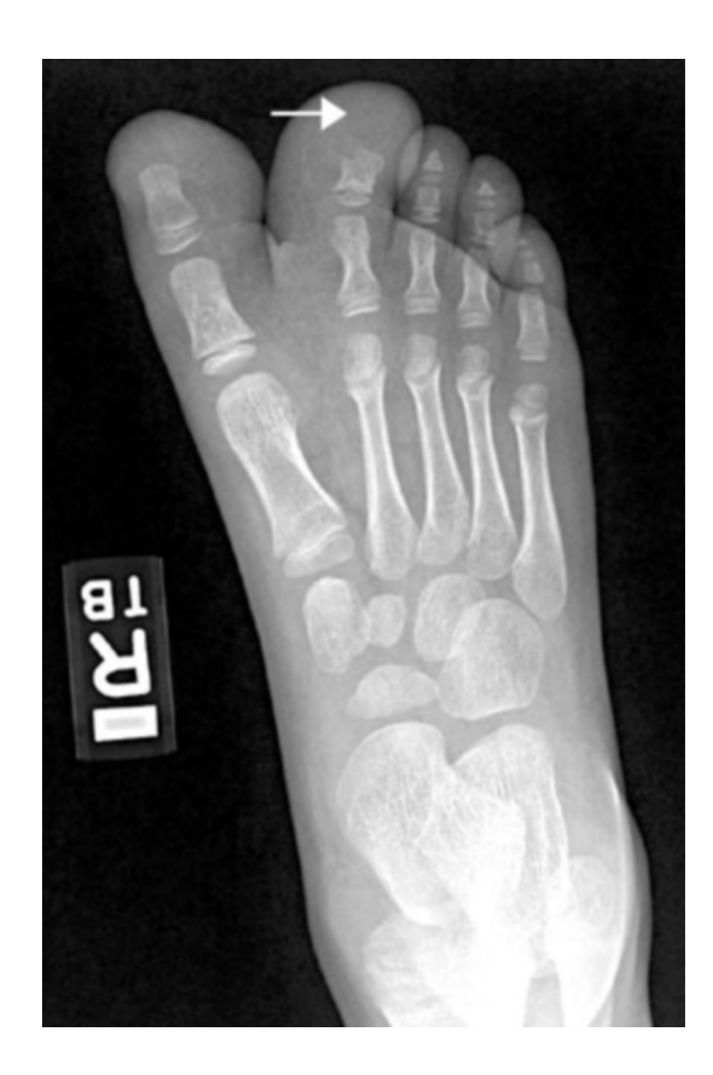
Figure 1. 4-year-old boy with macrodystrophia lipomatosa. AP radiograph of the right foot demonstrates enlargement of the soft tissues (arrow) of the second toe, which appears to be laterally deviated and approximates the first digit in size. Note is made of distal phalanx resection of the second toe with broadening and irregularity of the distal aspect of the remaining distal phalanx.

discussion physicians and family members determined that surgery would not be immediately offered. Pathology reports obtained from a separate institution, where the patient had undergone amputation of his distal phalanx, described an enlarged gross specimen with near normal architecture but with significant amounts of normal-appearing adipose tissue. His condition was attributed to macrodystrophia lipomatosa. Plans were made to monitor the child extensively to ensure mobility and functionality. Should these be compromised or the disfigurement become excessive, the pediatric surgeons would intervene.