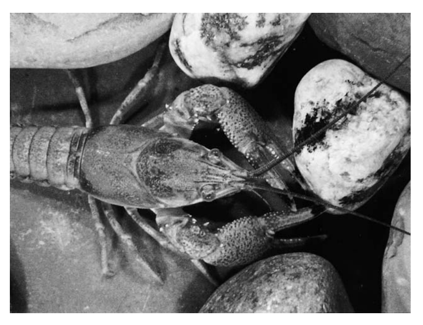
Fig. 1. Orconectes indianensis Hay in rock habitat.