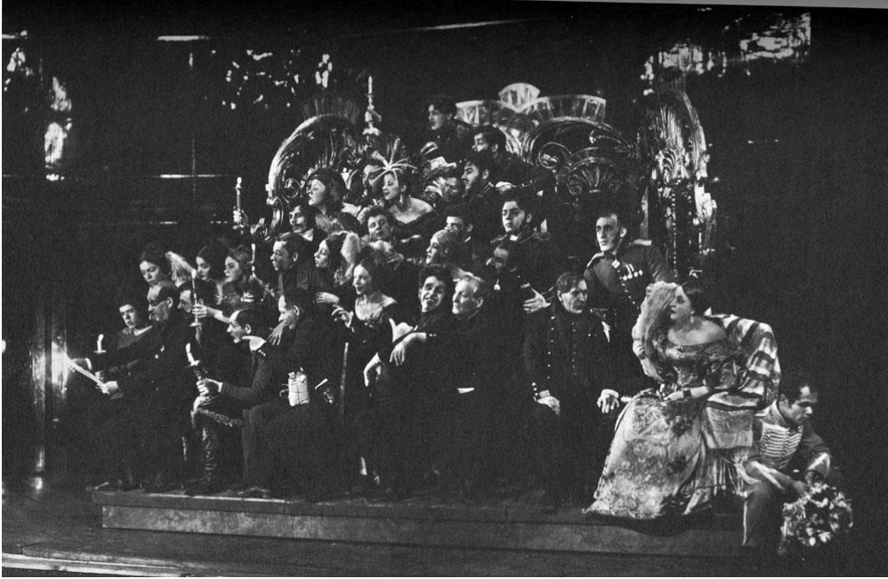
Figure 3.1. The General Inspector, Final Scene.