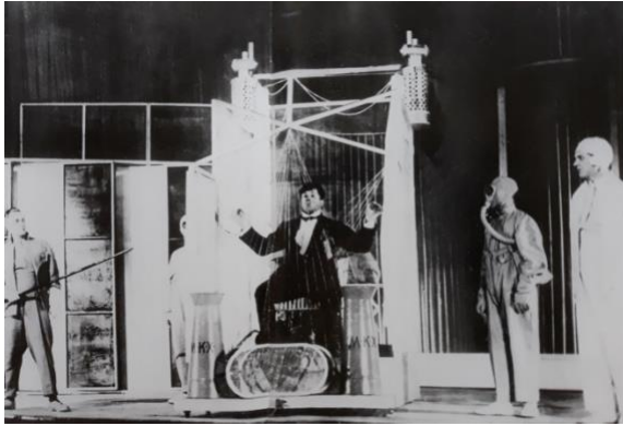
Figure 3.3 Prisyarkin being unfrozen in the second part of Bedbug . Source: Konstantin Rudnitsky, Russian and Soviet Theatre: Tradition and the Avant-Garde , p. 258.

Lunacharsky defined the new themes as those that would revise all relationships through the new prism of socialism; revise the understanding of the human condition; the notion of cooperation; the notion of universal and eternal situations, such as love and death; and illuminate the tendency to bring harmony to conflicting forces 284 .