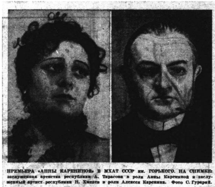
Figure 4.5. On the day of its premiere, Anna Karenina was featured on the front page of Izvestiya , a fact that illuminates the importance that was attached to theatre. Articles and reviews of the play dominated the press for a long time.