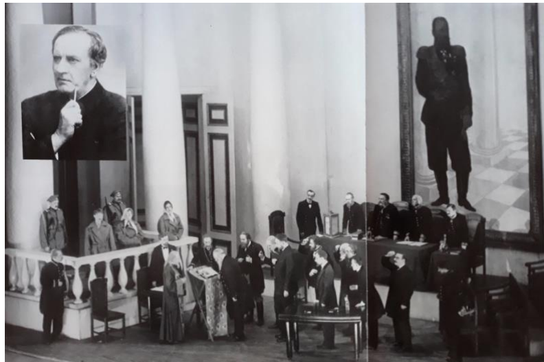
Figure 4.4. Scene from The Resurrection with Kachalov as ‘the author’ (the top-left corner), standing among the audience.