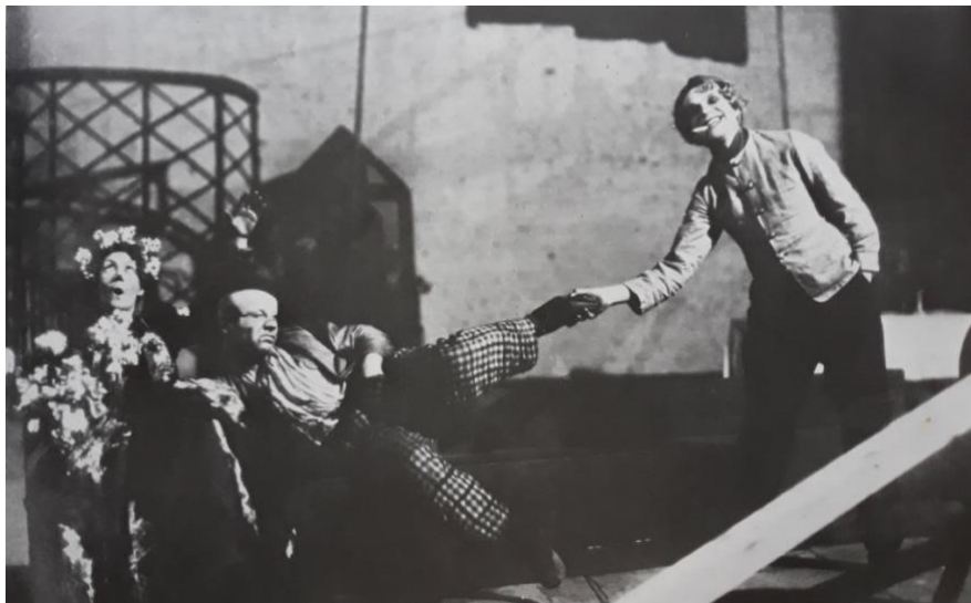
Figure 4.3. Ostrovsky, reimagined by Meyerhold; scene from The Forest (1923). Source: Beatrice Picon-Vallin, Meyerhold , p. 185.