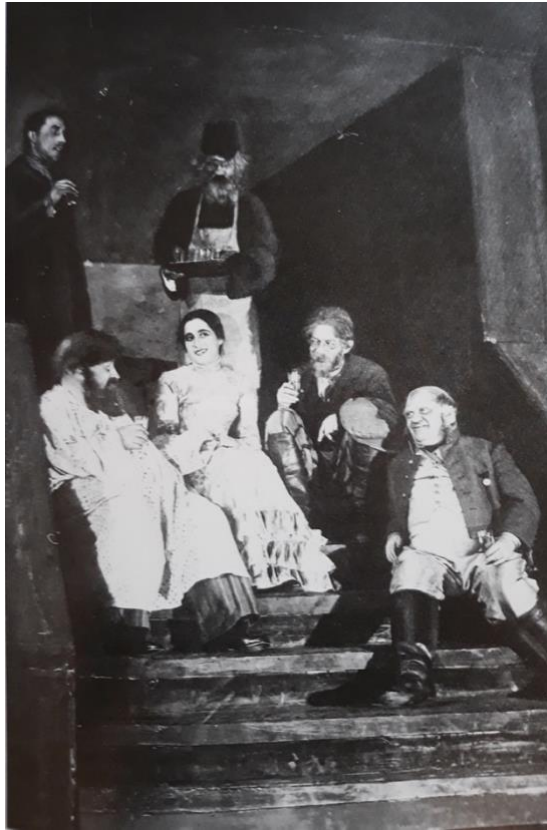
Figure 4.2. Ostrovsky, reimagined by Stanislavsky; scene from An Ardent Heart (1926).