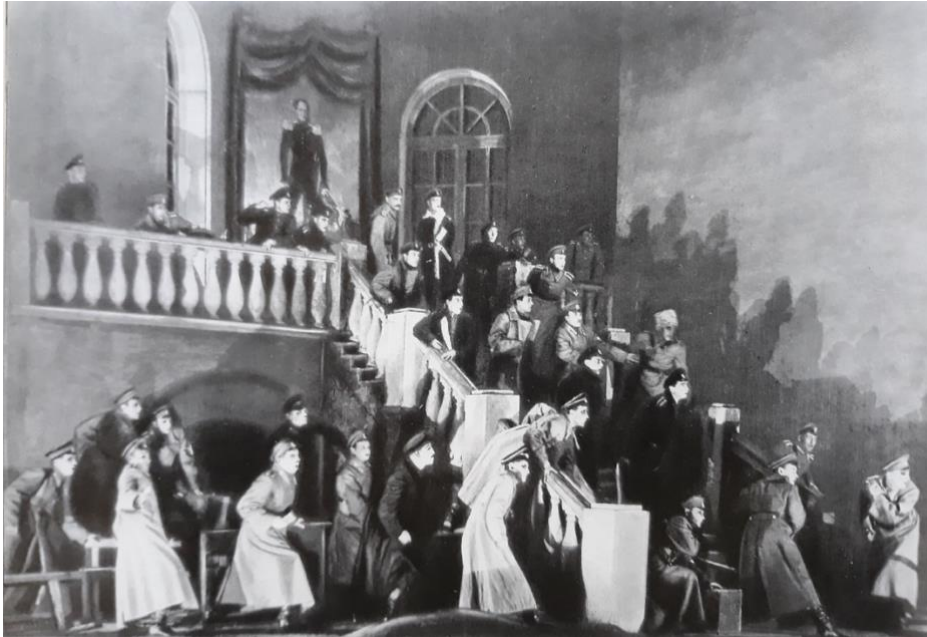
Figure 4.1. Scene from The Days of the Turbins .

their own means in order to continue their services to progress and advance the forces of our time' 392 .