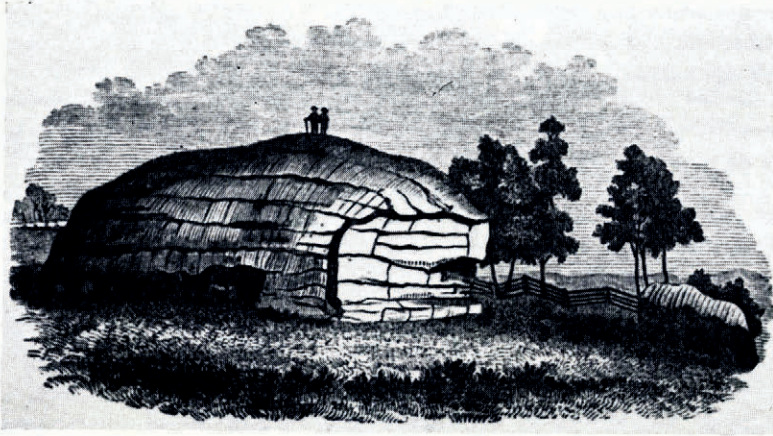
Fig. 2. One of the larger amphibolite boulders (from Lyell's (1871) account)