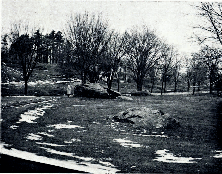
Fig. 3. Typical distribution of amphibolite boulders in an open field. These are from the "second train" of Reed. December, 1965

Berkshire Hills and Taconic Mountains, for upland pastures were then more extensive, not only because of more intensive grazing, but because of the demand for hardwood for the local charcoal-burning iron furnaces. More important, Reed's geologic training sharpened his powers of observation, for although the amphibolite boulders are different on close inspection from the local schist, limestone and quartzite, the weathered appearance of the erratics would not set them distinctly apart to the casual observer. As a farmer, Reed was