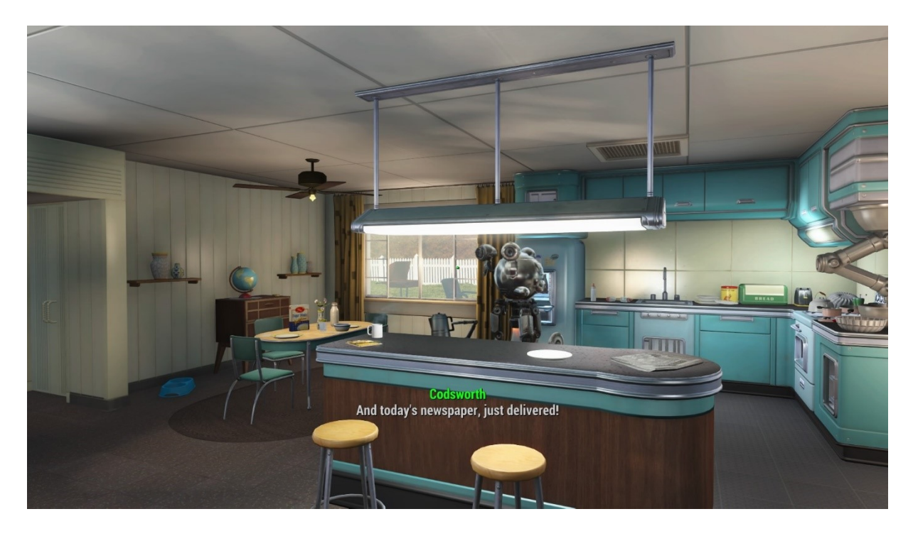
Figure 8 The interior of the player's house before the Great War

accompanying the Smithsonian exhibition (xii, emphasis in original). Figure 8 below gives a glimpse of Fallout 4 's retrofuture before the bombs fell, complete with a domestic chore robot. The game's aesthetic is an augmentary narrative experience (Pearce "Game" 145), underlying all other narrative experiences of the game because they are molded to fit its mode.