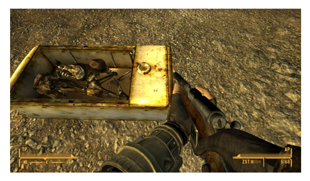
Figure 5 Evocative micronarratives in Fallout: New Vegas

Jenkins furthermore differentiates between the enacted and embedded narrative, with the former being roughly congruent with a game's main story or quest – i.e. a performance of narrative events on a pre-structured stage set by the game (Jenkins 124-26), and the latter as embedded narrative being "relatively unstructured and controlled by the player as they explore the game space" (Jenkins 126). The embedded narrative asks the player for "acts of detection, speculation, exploration, and decryption" (Jenkins 128) to reconstruct past events. Potential for embedded narrative can be found in a variety of game objects and locations, but especially written records or objects in the mise-en-scene lend themselves well for embedded narration. Figure 5 shows an embedded narrative clarifies that this was a detainment camp for political dissidents prior to the fall of the atom bombs: