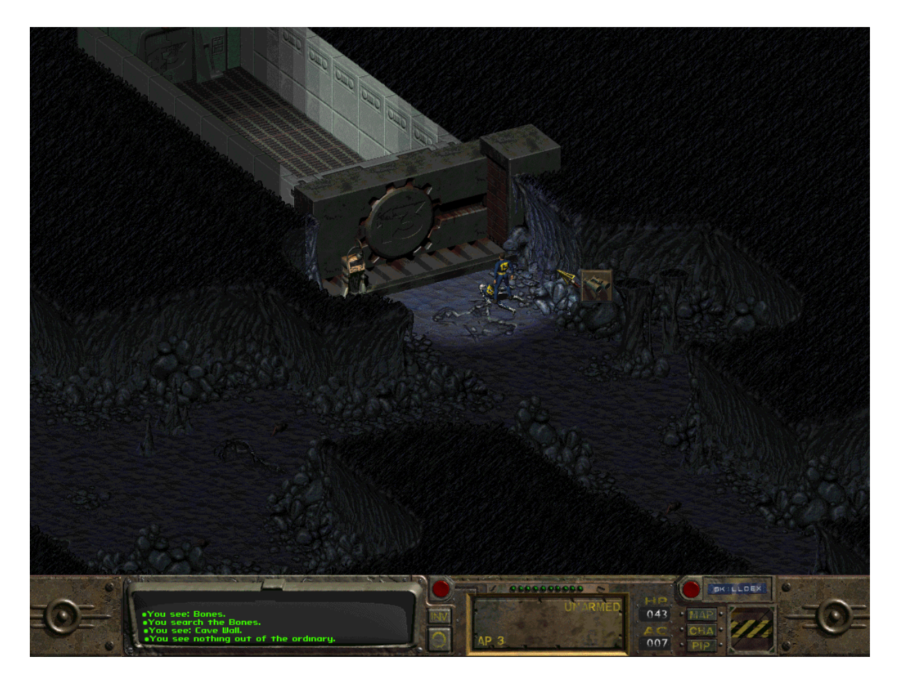
Figure 1: The player character of Fallout 1 leaving their Vault

Each player action in Fallout 1 is accompanied by a verbalized feedback in the lower left corner, spelling out the actions (or lack thereof) to the player. Interestingly, by employing a "you", the player is interpolated to inhabit the role of the character they are playing. Movement is only possible along hexagonal tiles, and any fighting is purely turn-based, i.e. the player character and the enemies take turns to act against each other. All of these aspects of the game's mechanics are very close to both earlier, text-based adventure games and to classical role-playing games like Dungeons and Dragons . The semiotic cycle of the ergodic operation is transparent: by clicking on something, the character moves – a change of state of the game – and the game gives verbalized feedback to the player of the outcome of their interaction, e.g. "You see nothing out of the ordinary." This information in turn changes the player's mental state.