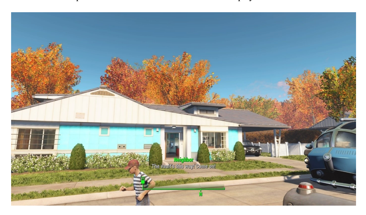
Figure 12 The player character's house prior to the Great War

A novum in Fallout 4 that separates it from preceding titles is the fact that the player, however briefly, gets a chance to play before the bombs fell, and is invited to a direct comparison of the starting area before, and after the Great War. The first depiction of ruins in this discussion very much begets such a comparison: it is the player character's house, the last structure they see before entering the vault, and usually the first they encounter after escaping. Figures 12 and 13 offer a direct comparison of this structure before and after the player enters the vault: