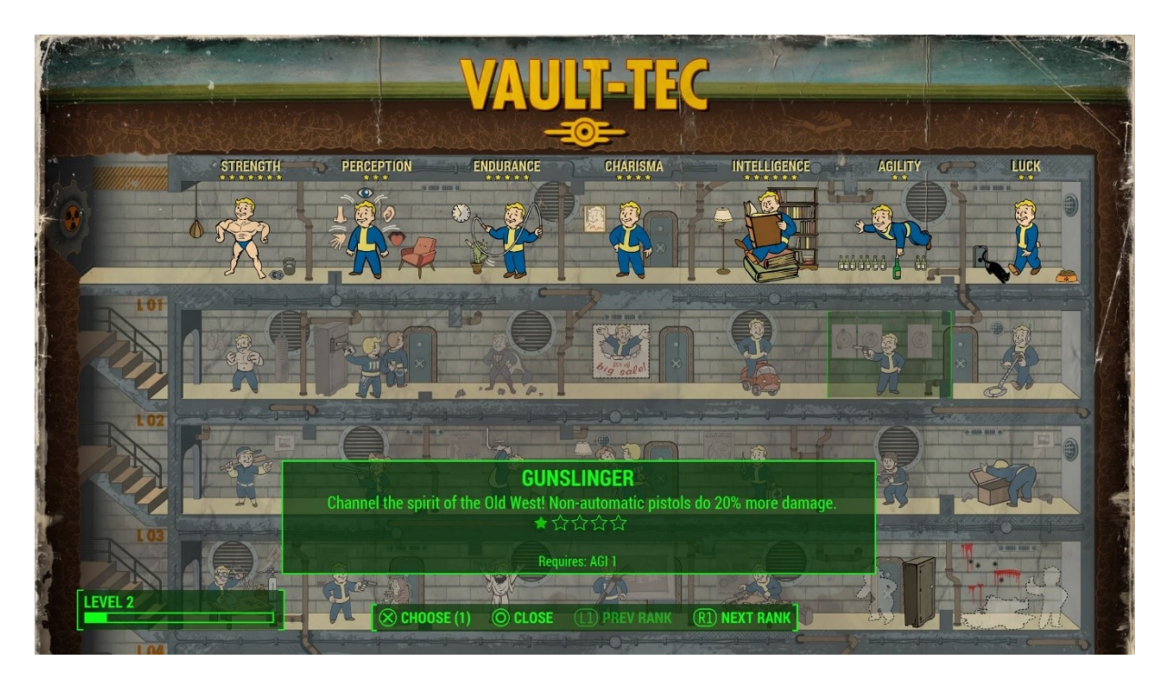
Figure 22 Overview over the player's stats and perks

Levelling up in Fallout 4 works very similar to most role-playing games: after having slain enough enemies, or completed enough quests to accumulate enough experience points to be pushed over a threshold, the game rewards the player with reaching a new level. In Fallout 4 , leveling up means either adding a point to one of seven character values, or choosing from a variety of perks, which have different effects on gameplay. The selection of perks is determined by the character values, in a way where a strength stat of one only allows the player to obtain a strength perk from tier one. Figure 22 shows the first three tiers of perks and their character values.