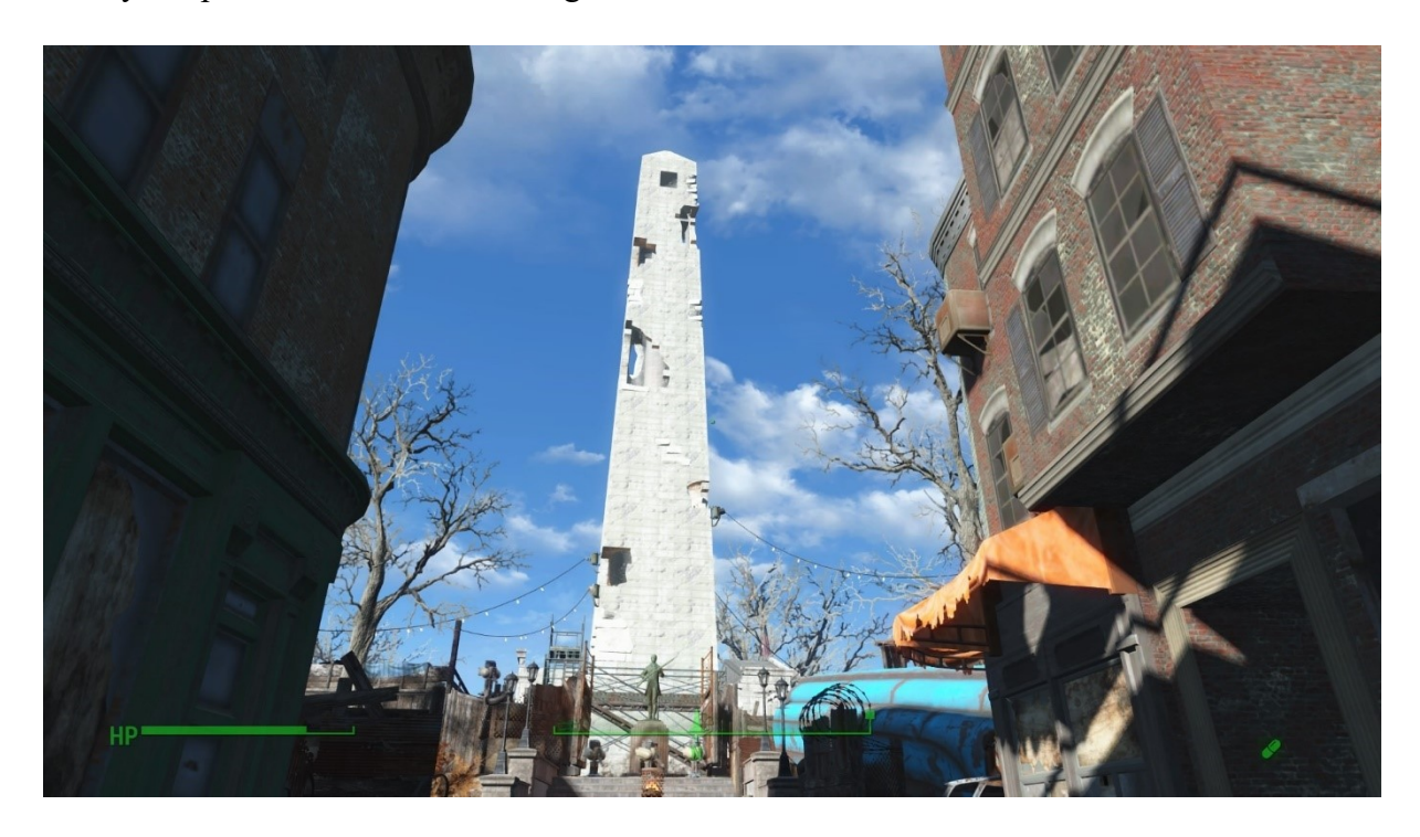
Figure 15 Bunker Hill Monument in Fallout 4

Consider, for example, the game's rendition of the Memorial of Bunker Hill in figure 15: it is visibly dilapidated, but far from being a traditional ruin.