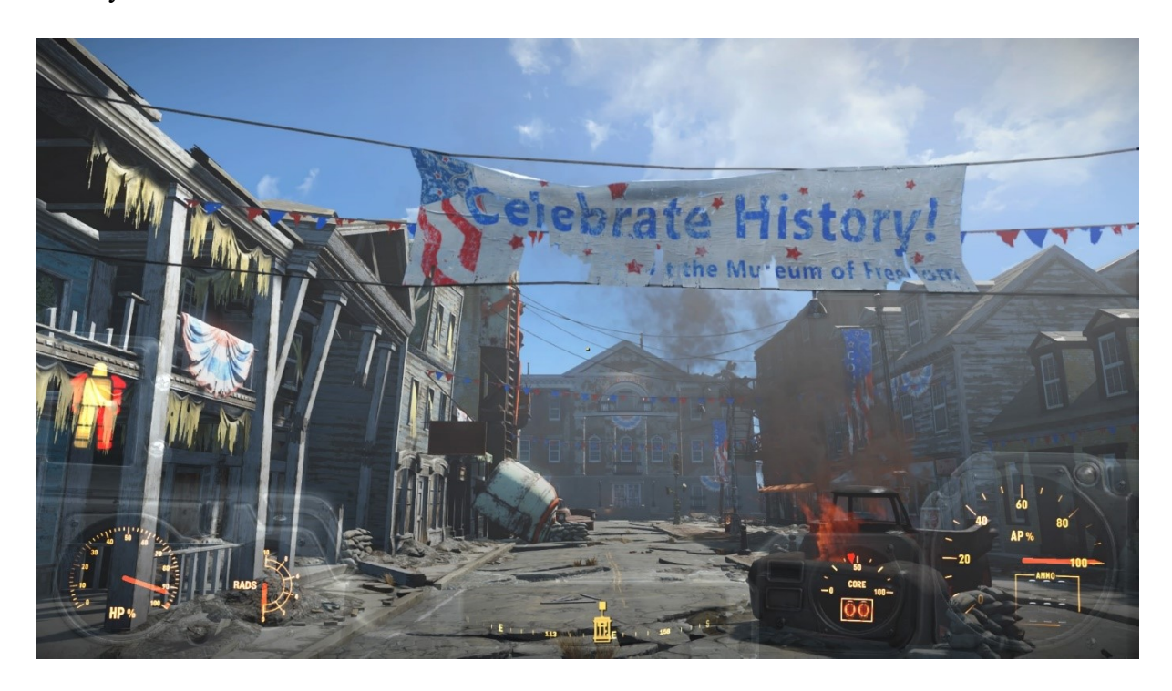
Figure 9 'Celebrate History!' banner in front of the Museum of Freedom

Minutemen from the Museum of History. The banner in front of it (fig. 9) reads: "Celebrate History!"