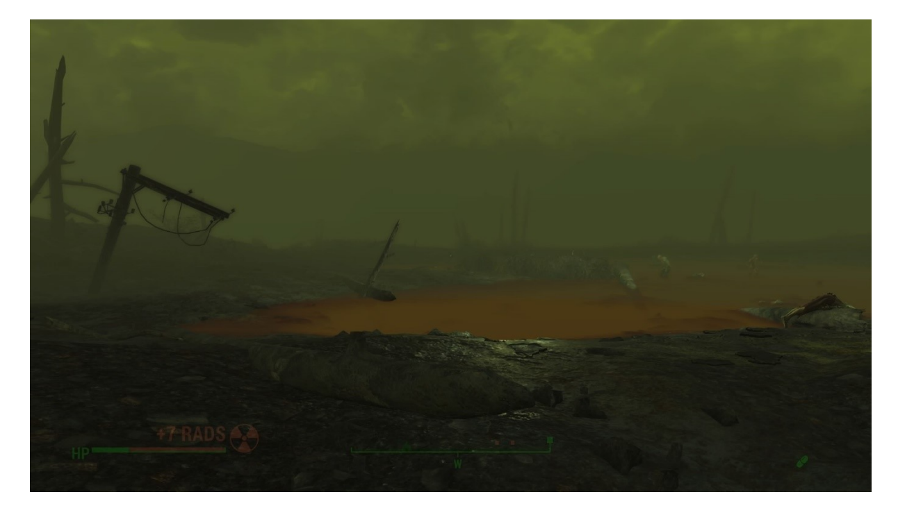
Figure 19 The Glowing Sea

This evocation of pollution in the Glowing Sea brings the nuclear ecology of Fallout 4 back to a full circle. Visiting the Glowing Sea is a kernel event of the game, traversing it is mandatory to complete the game. Should the player choose to investigate the place, they will inevitably come across abandoned factories, a decrepit nuclear power plant, and even an abandoned bunker, filled with nuclear warheads. While the game itself explains the highly irradiated ecology of the Glowing Sea by stating that this was where a nuclear warhead detonated during the Great War, the locations found in the Glowing Sea evoke a different kind of pollution. The densities of ruins of factories and the presence of a nuclear power plant connect the Glowing Sea to present-day questions of pollutions. The Glowing Sea in its overt toxicity is not subverted by the notion of an atomic sublime. In its pollution, it represents a taste of what might be a possible future. Its presentation as actively hostile and claustrophobic demarks it from the rest of Fallout 4 's ecology. It does not signify the overcoming of an ecological catastrophe like climate change – instead, it illustrates a possible result.