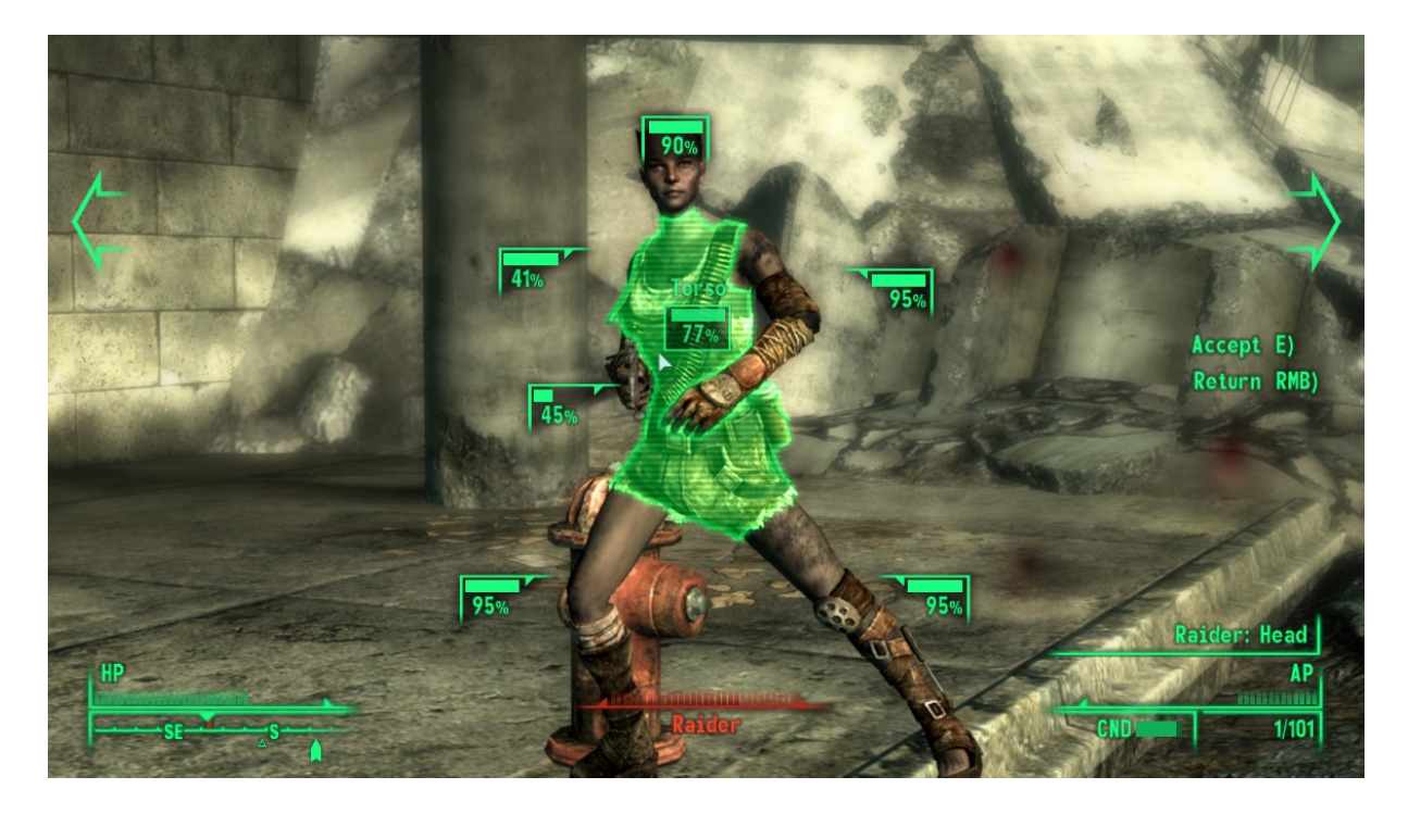
Figure 2 Activating the targeting systems stops time in the gameworld in Fallout 3

In fact, Eskelinen touches on a much more interesting point regarding temporal relations: while it is clear that there should be no noticeable delay between the player's input and the action on screen, the reverse holds true as well: the actions on screen, governed by the game engine, demand a reaction by the player in the form of another input, and timing here is of the essence. Essentially, many games across genres demand near-perfect timing of inputs by players to progress the game, making timing an obligation the player has to fulfill (Wiemer 36). Essentially, for some genres, the relation of action and user time is determined in two ways: the immediacy of an action following an input is expected by the player and necessary to progress, as the action on screen demands additional input, which can be time sensitive. While the relation between user and event time was unidirectional in Fallout 1 & 2 , as of Fallout 3 , combat was no longer turn-based but rather realized as heated, three-dimensional battles, and therefore required precise timing. Interestingly, Fallout 3 also introduced a feature called VATS<sup>5</sup>, which pauses game time and allows for precise targeting, and thereby massively deemphasized the obligation of the player's timing.