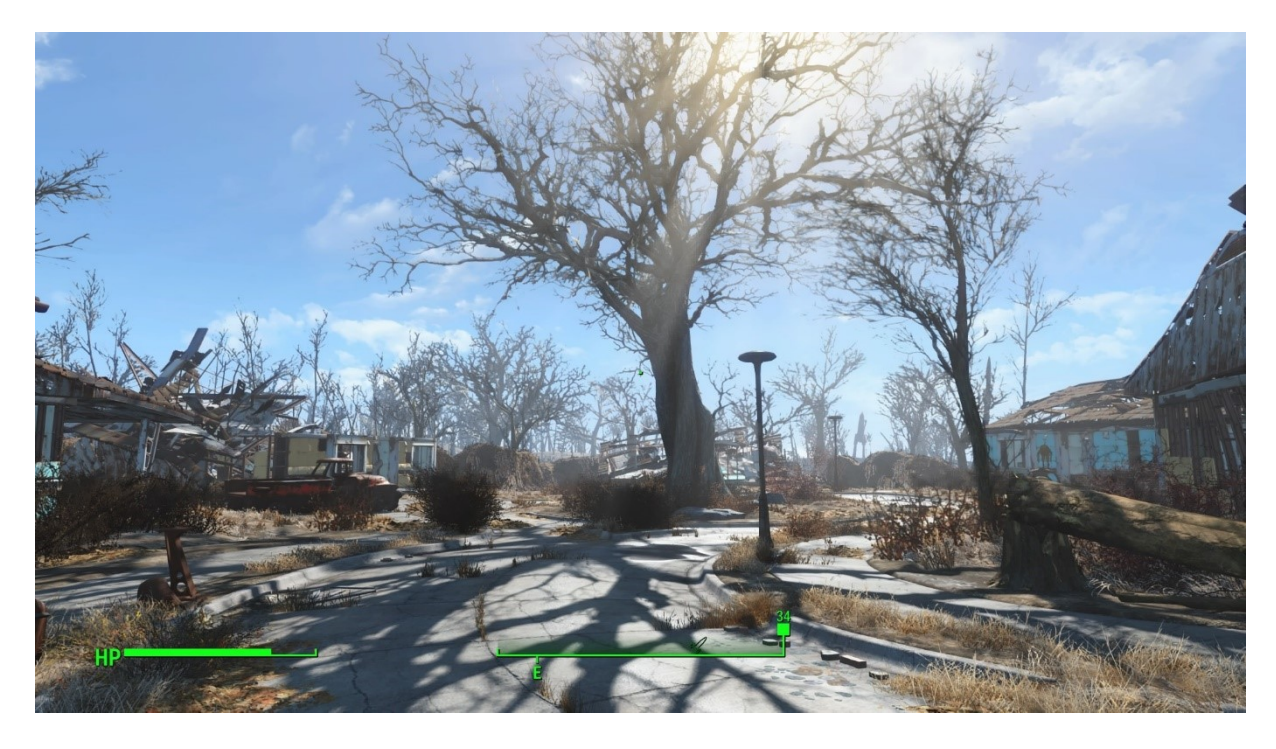
Figure 18 The Nuclear Ecology of Fallout 4

There is, however, another facet to this exaltation that cannot go unmentioned. Much of the sublime feeling evoked by the nuclear ecology of Fallout is due to its mediality. It is, after all, a completely computer-modelled landscape, one that achieves a high level of 'realism'. Much of the sublime feeling associated with it stems precisely from the fact that it is not real. The awe it inspires is therefore not only in what this ecology transports, but also in its medium.