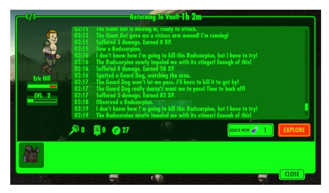
Figure 3 Log of real time exploration in Fallout Shelter

Additionally to the time relations also found in novels or films, videogame feature a unique time relation: a selective 1:1 mapping of game time to real time. This is different to the scene in the sense that this mapping does not allow for a cessation of this relation, i.e. even when the game is not being played, time still progresses in the game. The mobile spin-off game Fallout Shelter , first introduced as a smartphone-game, features mechanics that utilize this mapping of game and real time. The casual game, a population manager simulating one of the iconic vaults of the series, allows for an option to send a vault dweller out into the wasteland to gather resources. The dweller disappears from the game world proper, and their travels are displayed in a travelogue form (figure 3). The progress of their exploration depends on how much time has passed – not time spent playing.