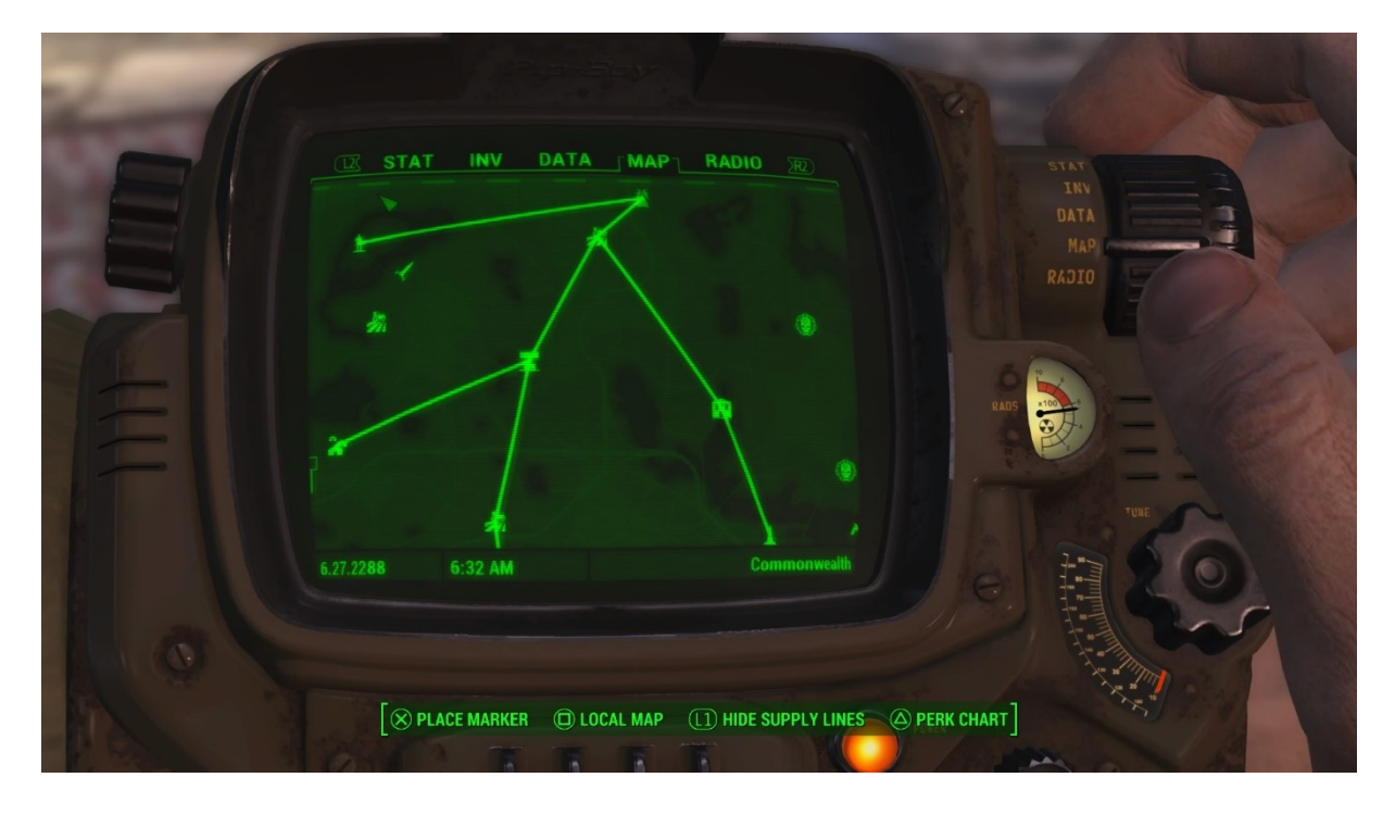
Figure 20 The in-game map of settlements in Fallout 4

But it is not only in the game's narrative that this trope of the frontier is echoed. As a novum to the series, Fallout 4 features the workbench- and settlement mechanic. This gameplay mechanic allows the player to utilize workbenches, placed strategically in the wasteland, to build structures like huts, walls, or decorations. The player can scrap existing structures, or use junk found throughout the map, to create new settlements. These settlements will then be inhabited by non-player characters, which the player can assign to a variety of duties, such as farming, resource production, or guarding of the settlements. These settlements can be linked up via trading routes, essentially establishing a new empire with the player character as its head. Figure 20 shows settlements spread across the in-game map, the lines connecting them indicate active trading routes.