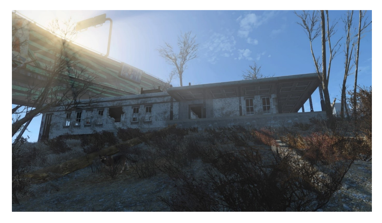
Figure 14 Ruin of a retirement home

Such ruins are evocative spaces of the game world, often filled with micronarrative experiences. A ruin like the one in figure 14 usually features carefully placed skeletons or other atmospheric details, not only enriching the gameworld, but also marking death as an "implicit feature" of it (Spokes 147). These all-present ruins are also constant sites of combat themed unit operations, and the death they represent is thereby mirrored with literal deaths of the player's avatar or other, non-player characters (Pichlmair 109).