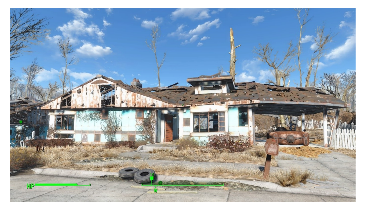
Figure 13 The player character's house as ruin

This ruin is special – not because it is parsed by the player as their literal domestic dwelling, bur rather because the game allows us to see it untouched beforehand. The interior, once pristine, is encountered again as abandoned, smashed, forgotten. While some critics have expressed doubt about the obsession with ruins simply being ground in nostalgia (e.g. Gansky 123), it is clear that nostalgia plays a significant role in such a depiction. The pristine house and its interior are symbolic for a presumed past way of life. In this way, these ruins are not simply evocative spaces, but also spaces enriched by augmentary narratives. Economic history suggests that such a picture is not inaccurate: the building of single-family homes skyrocketed between 1946 and 1956, and spending on furnishing and household appliances rose by 240 percent between 1945 and 1950 (Coontz 24-25). It is, however, not the factual accuracy behind the pristine home, but rather its promise of economic growth and stability that inspires nostalgia. In many of the domestic ruins of Fallout 4, such a nostalgia is evoked. This is not a nostalgia for a specific period of time but rather the promises that it supposedly held. The fact that the series' revival with Fallout 3 in 2008 coincided with a large-scale global financial crash and a decade-long recession contextualizes this nostalgia even further in the supposed promise of (economic) stability.