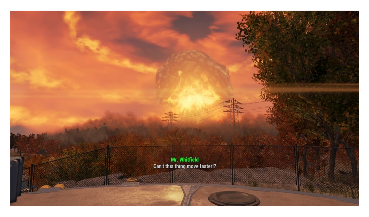
Figure 17 The Mushroom cloud of Fallout 4

and all of ecology became understood as a dominion of human and nuclear influence (Hales 28). This understanding of the atomic sublime is referenced in Fallout 4 in how it portrays the nuclear detonations, happening just mere seconds before the player enters the vault in the beginning of the game (fig. 17).