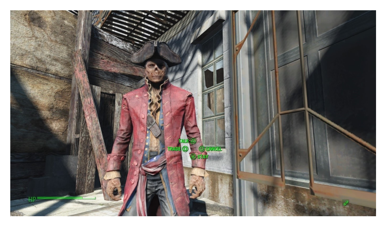
Figure 10 The game's version of John Hancock

Furthermore, the game features an non-player character named John Hancock (clearly named after the historical figure), reimagined as period-cloth wearing, drug-addicted, borderline maniac ghoul (fig 10).