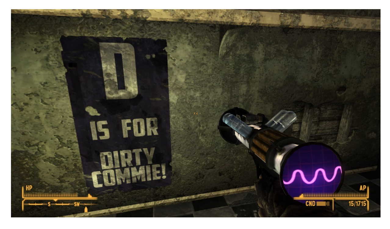
Figure 4 Screenshot of an evocative space in Fallout: New Vegas

apocalypse, but also points more specifically to its alternative history perpetually stuck in the Cold War and the Red Scare.