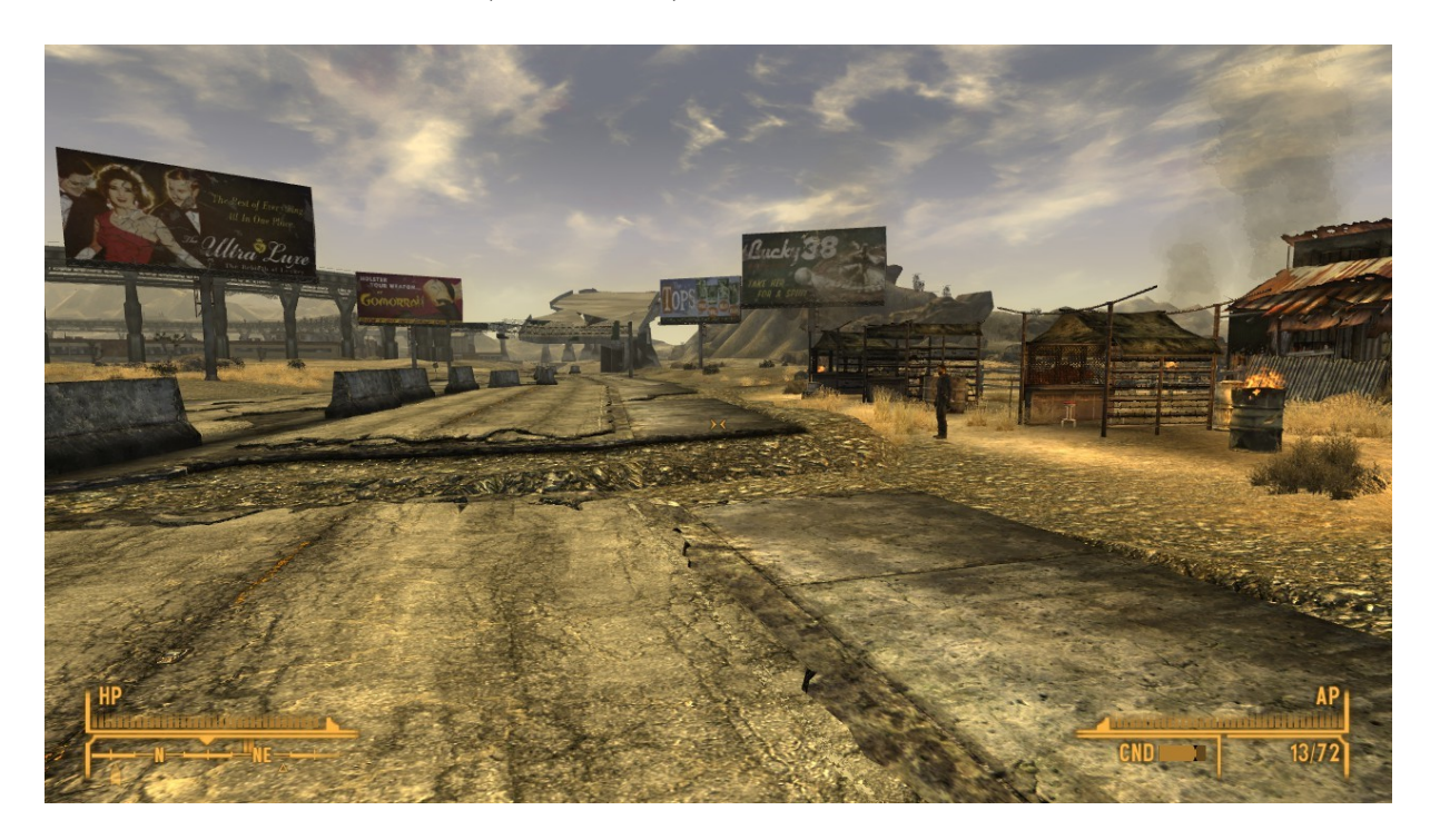
Figure 7 Potential augmentary narratives in Fallout: New Vegas

game proper, but may be cultural knowledge, fan theories or journalistic coverage of or about a videogame (Pearce "Game" 145-46). Figure 7 shows such potential augmentary narratives in the form of casino advertisements – the leftmost billboard, an advertisement for one of the casinos found in Fallout: New Vegas , has been theorized by fans to be a fictionalized stand-in for the Caesar's Palace casino ( Fallout Wiki ).