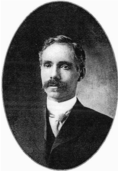
Government biologist Wells Cooke launched a program to document bird migration habits that eventually swelled to 3000 volunteers across North America. The program ran from 1890 to 1970, and now efforts are under way to transcribe all of the handwritten records.

transcription software a requirement for each card to be entered twice, by different transcribers, so inconsistencies can be weeded out. If the two entries don't match, the card is sent back into the pool to be transcribed again. Zelt says efforts are under way to collect similar data through contemporary observations, thereby strengthening the value of the historical information.