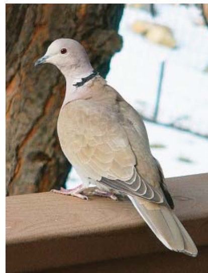
The Eurasian collared dove is an invasive bird species whose colonization of North America has been documented in part thanks to observations by participants in the Cornell Lab of Ornithology's Project FeederWatch.