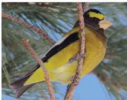
Researchers confirmed the decline of the evening grosbeak population, once one of the most common feeder birds, after analyzing data submitted by Project FeederWatch observers.

Gram says another goal is to develop NEON's citizen science projects in such a way that scientists anticipate the data and are ready to use them when they're available. "Everyone, including NSF [National Science Foundation] and research scientists and educators and this whole broader community, recognizes that it's great to collect all this data, but if the data themselves aren't usable and accessible and actually being valued by a variety of communities...that is going to be a disservice to all of the effort and funds that are being put into it."