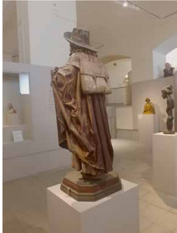
Figure 5: Gothic figure of St James the Greater and Ancestral Figure (Luba People) Democratic Republic of the Congo from the exhibition Beyond Compare , Bode Museum Berlin, 2019, Photo: I. Gadowska