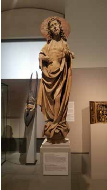
Figure 4: Gothic figure of Christ as the Man of Sorrow and Gabon Mask from the exhibition Beyond Compare , Bode Museum, Berlin, 2019.

Africa from the Ethnologisches Museum into the magnificent Renaissance sculpture collection of the Bode Museum.