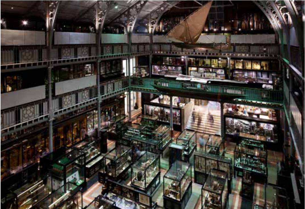
Figure 2. View of archaeological and ethnographic collections. Pitt Rivers Museum, Oxford, 2017.

to the colonial ideology known as the “civilizing mission”. 20 This vision of Africa and its inhabitants allowed many critics and art lovers to ignore the continent’s many forms of artistic expression, treating such creations not as works of art (nor their creators as artists) but strictly as bizarre or strange objects whose proper place is, at best, in ethnographic museums. Opinions and attitudes towards African art were also determined by preconceived ideas and philosophies about race, as a result of which the creations of African artists were not categorized as true “art” in the Euro-American sense of the word.