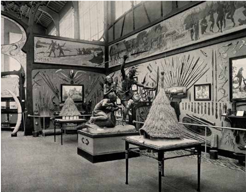
Figure 1: Musée du Congo, Tervuren, Belgium: one of five interior scenes, 1897. Collotype. 12

Exploration and the beginnings of the colonial era ended the period dominated by curiosity collecting, in which collected objects served primarily as souvenirs. The classic cabinets of curiosities emerged in the sixteenth century, although more rudimentary collections had existed earlier. In addition to the most famous and best documented cabinets of rulers and aristocrats, members of the merchant class and early practitioners of science in Europe formed collections that were the true precursors to modern museums. Gradually, the gathered memorabilia brought from overseas journeys left the curiosity cabinets and began to appear in newly established ethnographic museums. Initially, African art was exhibited in ethnographic museums, which were created in the colonial era to reflect the remoteness between the metropolis and the primitive African world. Later, these museums turned out to be a true treasury of information about the “Black Continent”.