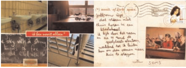
Figure 5. Fragment from Roodlapje by Pieter Gaudesaboos, Lannoo, 2003.

manipulated visual material in the collages, fiction and reality (or what we would like to perceive of as reality) are mixed and also indirectly put into question (what is manipulated, and what is not?). This fragmentary collage technique and the tension between fiction and reality are key features in the picture books by Gaudesaboos. The fragmentary structure also forces the reader to become an active participant in the reading process connecting all of the details throughout the book into a meaningful unity.