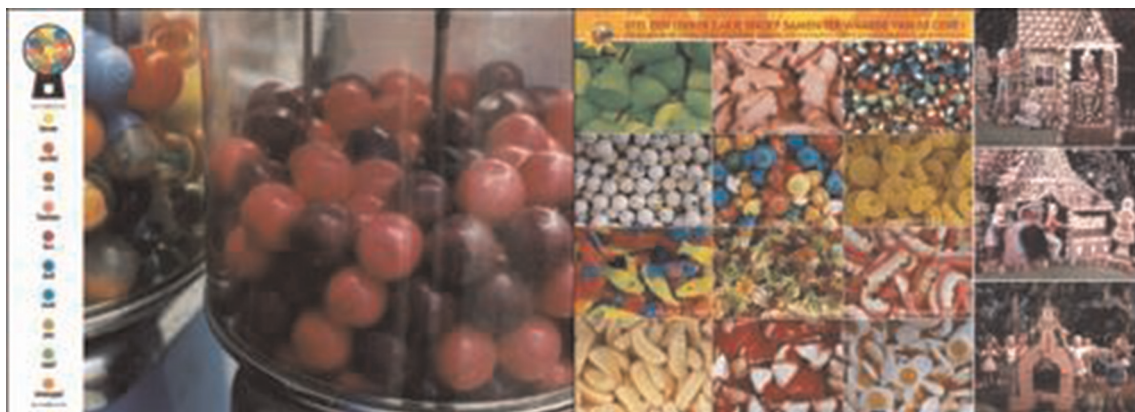
Figure 8. Double-spread from 123 piano! By Pieter Gaudesaboos, Lannoo, 2005.

On another page in 123 piano! , several rows of houses are drawn and the reader has to look for the Easter eggs that are hidden in some of them. The houses and the style in which they are drawn reoccur in other books by Gaudesaboos. On some other pages the nine slices of banana from the previously discussed book suddenly reoccur in a new adventure, this time looking for a place in the sun. By doing this Gaudesaboos also establishes a clear play with intertextual references to his own