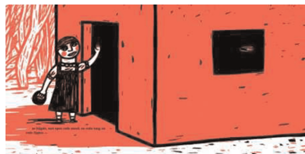
Figure 4. Fragment from Rood Rood Roodkapje by Edward van de Vendel and Isabelle Vandenebeele, De Eenhoorn, 2003.

Despite its very traditional opening line, Roodlapje by Gaudesaboos also proves to be anything but traditional. The book consists of what appears to be an associative collage where, for example, photographs, games, postcards, handwritten texts and drawings, 19th century looking writings and typography, mirror-reflected images, sequences of films and fragments of computer games follow each other freely (see also Joosen & Vloeberghs 2008, 76–79). This technique almost works as a visual ‘stream of consciousness’, the literary technique typically used by modernist authors such as Virginia Woolf and James Joyce. A central theme in Gaudesaboos' story is the loneliness of the protagonist Little Red Rag who seems to be moving in a grim, desolate, decayed and, through the structure of the book, also literally fragmented modern society (see Figure 5). 4 By using multiple photographs of everyday objects and sceneries in combination with the artificially