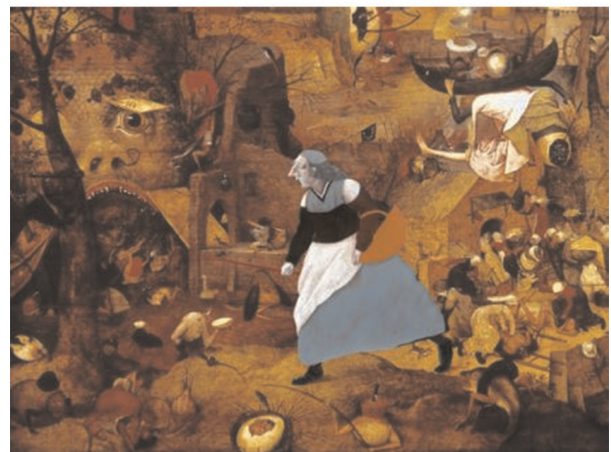
Figure 2. Fragments from Dulle Griet by Geert De Kockere and Carll Cneut, De Eenhoorn, 2005.

combined into a new unity. To conclude the circle, the original painting by Brueghel is shown on the backside of the book serving as a direct visual source of reference (see also Beckett 2012, 175).