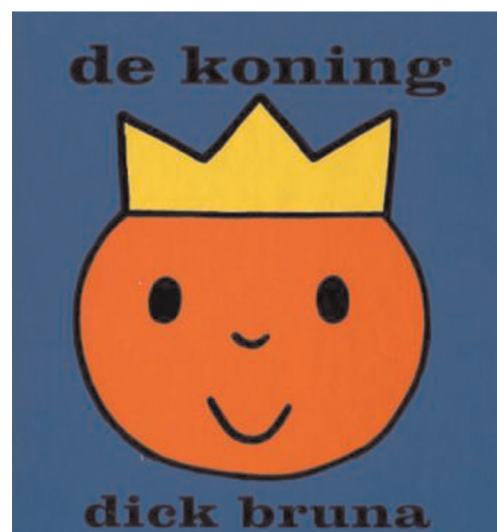
Figure 3. Nijntje (1963), Nijntje in de sneeuw (1963) and De koning (1962) by Dick Bruna, Mercis.

and functionalism using a minimalistic design, relatively abstract forms and mainly primary colours (Van Meerbergen 2010, 36–44, 2012, 10–11). Important inspiration sources for Bruna